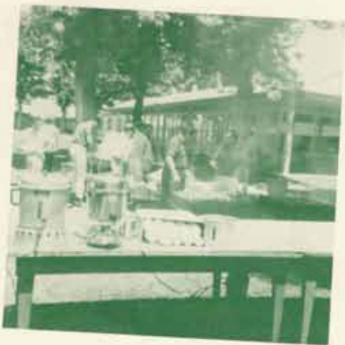
Outing's food committee hard at work.