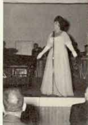
The Incomparable Kay Armen.