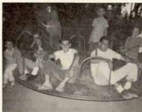
Fresno Jrs. new brothers.