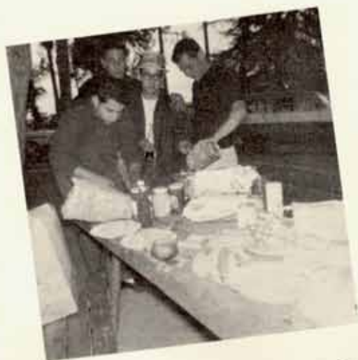
Fresno Junior's Social Committee?