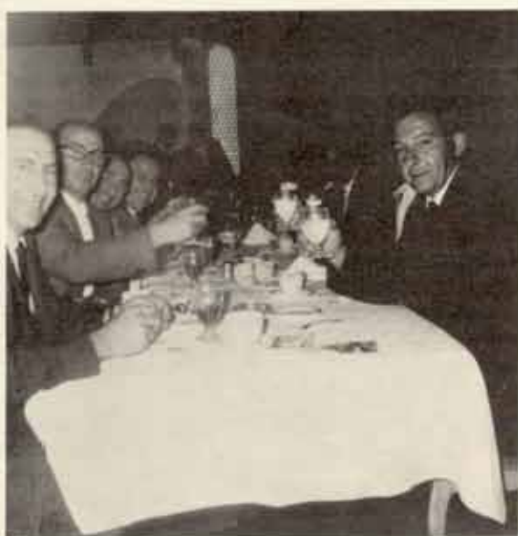
L.A. - Member & Guests (Sports Night).