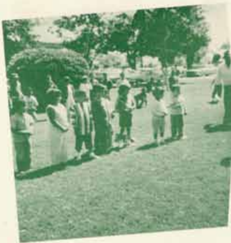
Lining up for first running event at Spring Outing.