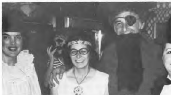
Master Vartan has everything under control at Halloween Party.

The Halloween party was held one week before its calendar date in order to avoid conflict with a Bazaar. The Trex Chapter seems to be alone amongst the Armenian groups in the Bay area in being sensitive to such considerations.