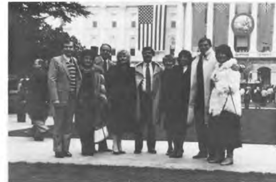
San Diego Brothers and Wives.