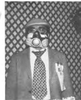
Associate Editor, Front.