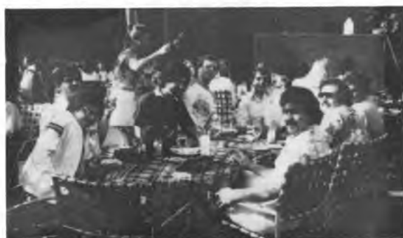
The Orange County Jr. Bros. enjoy brunch in Newport Beach with friends.

We are looking forward to seeing you all next Labor Day at the convention in Oakland.