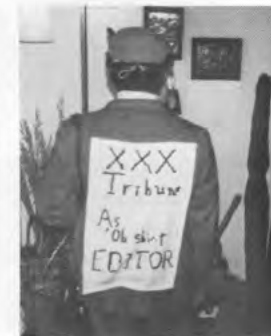
Associate Editor, Back.