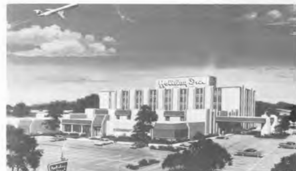
Sequoia chapter's 1984 "Keff" Convention Site. "Uskancheli eh mer yeghpainer!"