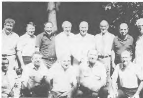
The Mt. Diablo Chapter at the Oakland Convention 1983.