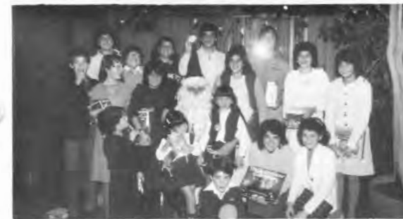
The Beautiful Mt. Diablo Children and Santa.