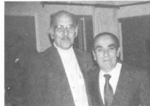
Grand Master and Junior Master.