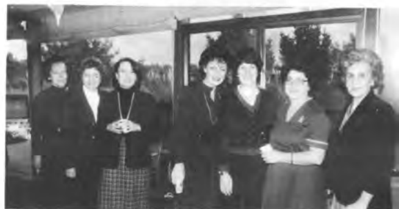
The Beautiful Mt. Diablo Ladies.