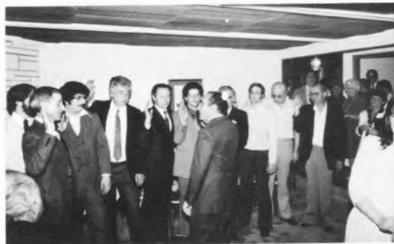
The Swearing in of the Officers.