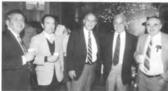
The (?) Mt. Diablo Dudes.