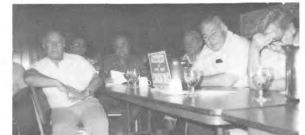
Meeting night is always a pleasant experience.