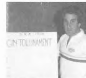
Oakland's Gin Tournament