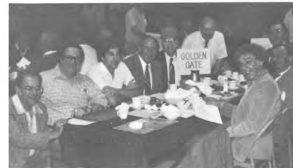
Golden Gate at Mid-Term '84.