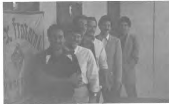
Jr. Trexmen now Seniors.