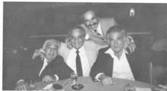
This looks like trouble!