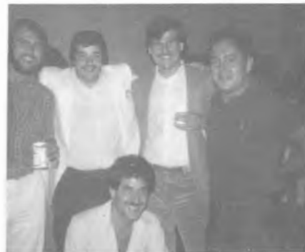
Orange County Jr. Trex—All single and will be at the Convention!