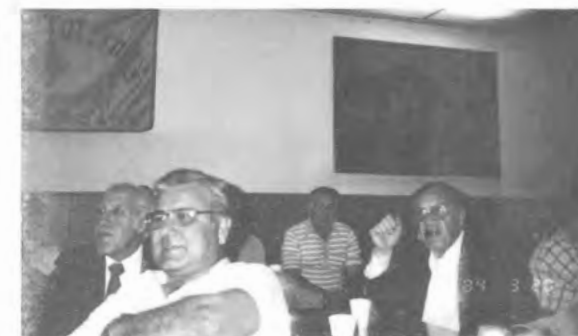
Joint Meeting with Mt. Diablo