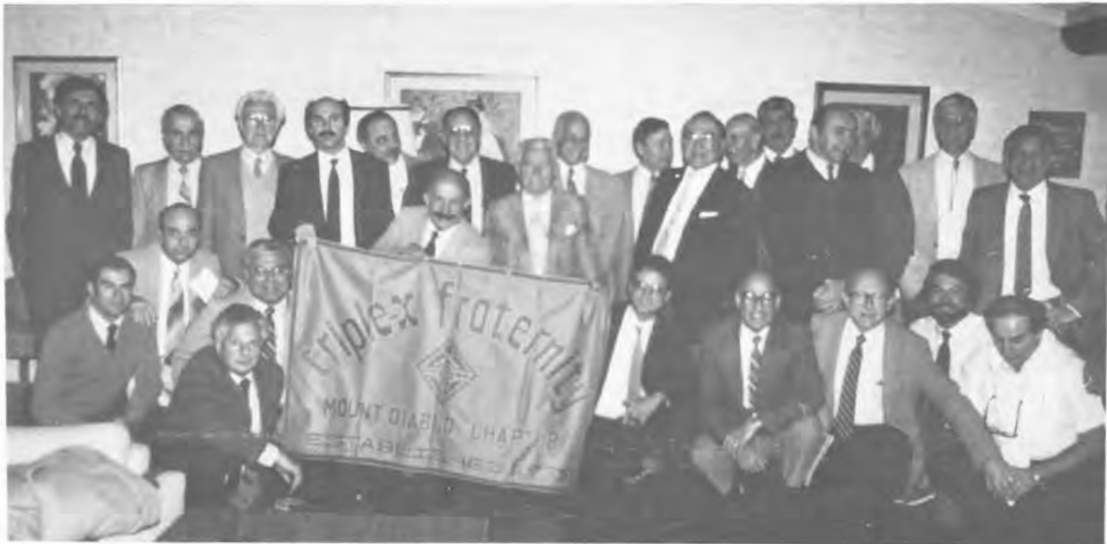
1987 Mt. Diablo Chapter