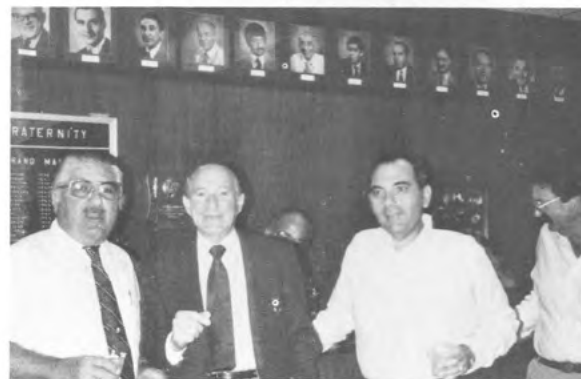
What did you say Bro. Master?