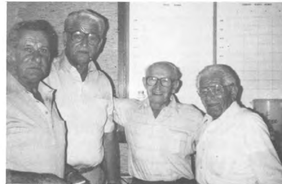
Smile for the Camera