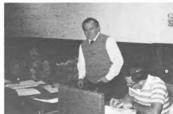
Grand Master visits Oakland

Garin Park in Hayward was the site of the Annual Family Picnic. A large group of Trexman and their families enjoyed a full day of activities at a