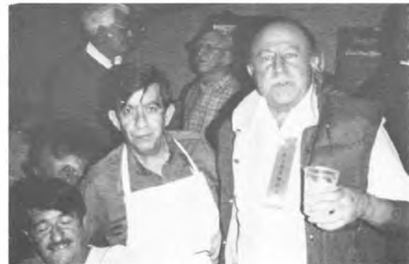
To the Fraternity