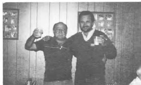
Father and Son.