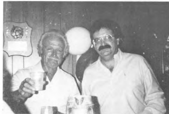
To your health