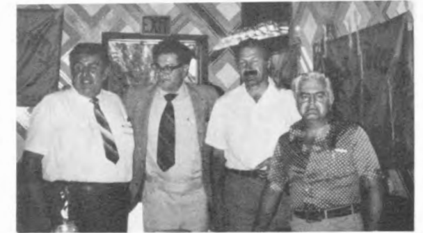
Roguary in Progress.