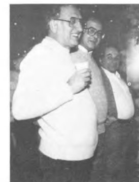
Look Mom, I ate all my Khema