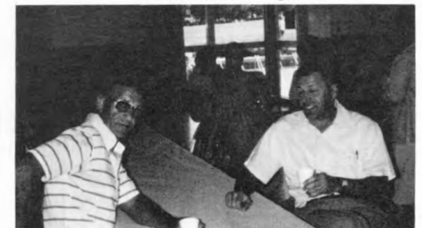
As I was saying.