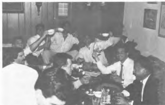
Jr's and Sr's at Moroccan Restaurant for February dinner meeting. We are toasting for no apparent reason.