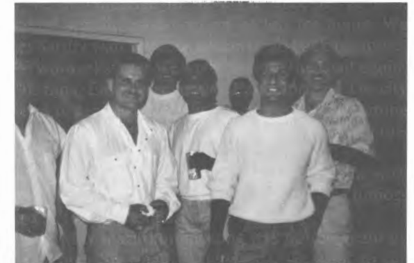
Orange County Juniors