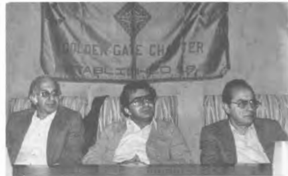
Some of our brothers at another exciting, interesting and productive monthly meetings.