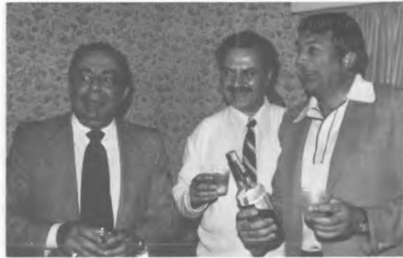
Some of our brothers at another exciting, interesting and productive monthly meetings.

Our brothers will be hosting a hospitality room at this year's San Diego Convention to give more information on the '88 Convention. It will be Sunday afternoon (after the business meeting) at the hotel. We invite all members and their families to be our guests for food and drink and conversation as to the highlights of the '88 Event. In other activities of recent months, a group of our brothers headed up to Lake Tahoe for a stag weekend back in May. It was quite an exciting 2 days for those