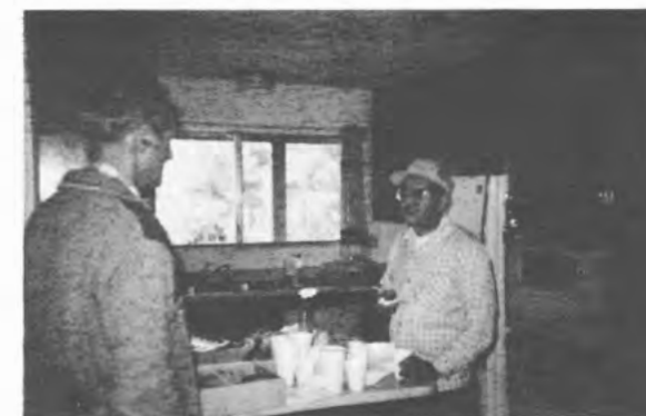
Cleaning Up at Nor-Cal Home