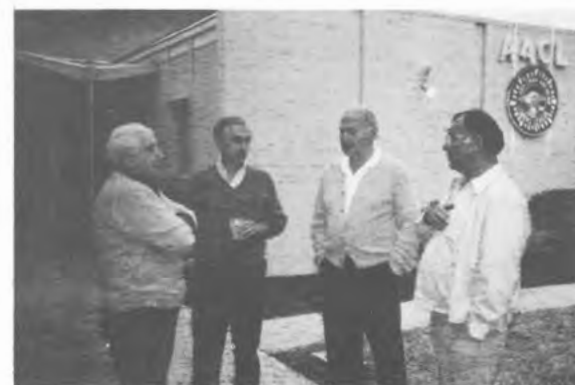
Mid-Term in Fresno