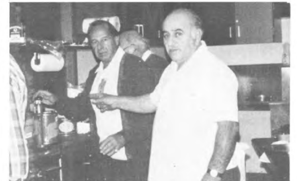
The chefs at work