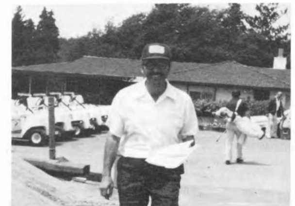
Here comes the Judge.