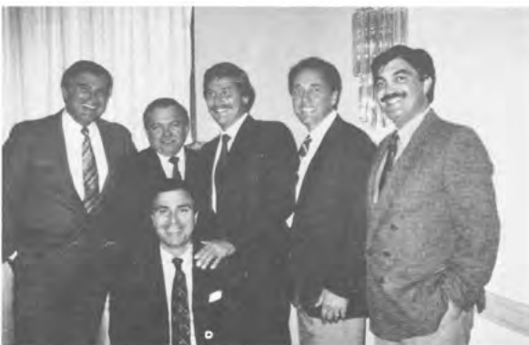
San Diego Bros. with Grand Master