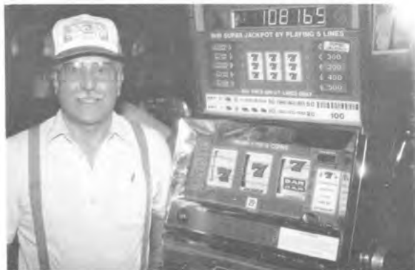
Bro. ED $1,081.65 Jack Pot