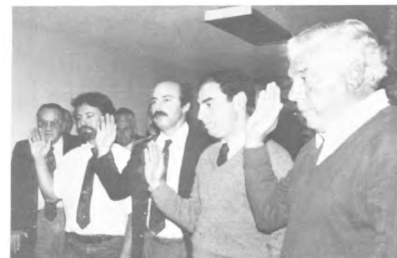
Induction of new members