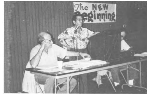
"Now hear this"