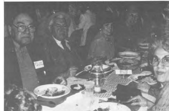
At the Banshee Ball everyone looks "Irish"