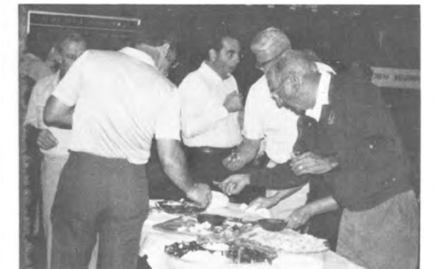
Eat, eat, eat