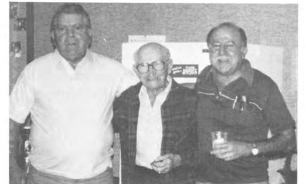
Friends at a dinner social at Trex Clubhouse.