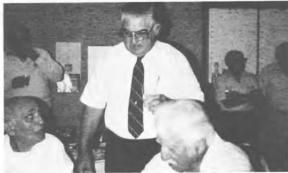
Did I do it right?