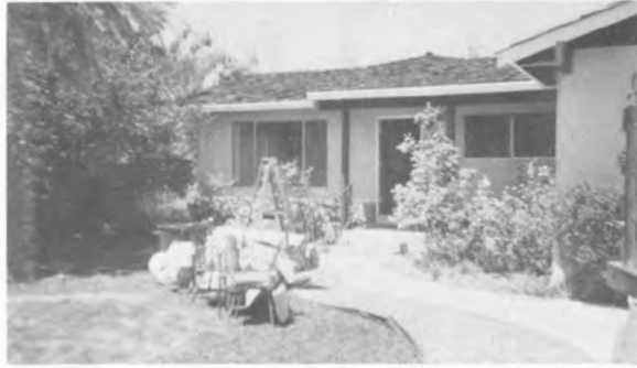
Nor-Cal Armenian Old Age Home