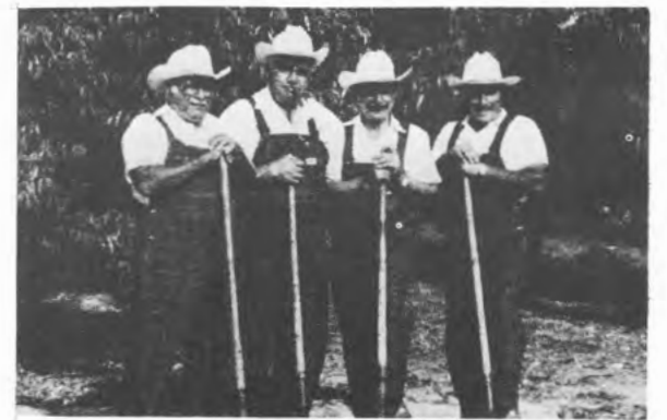
Farmers — Backbone of the country (Eat lots of fruit and vegetables)