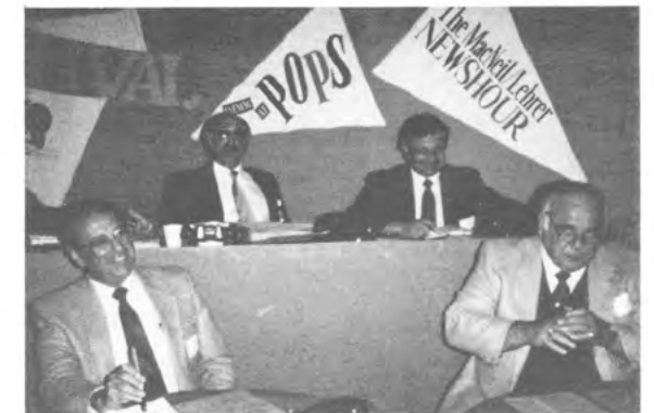
Brothers helping at Channel 18 Fund Raising.