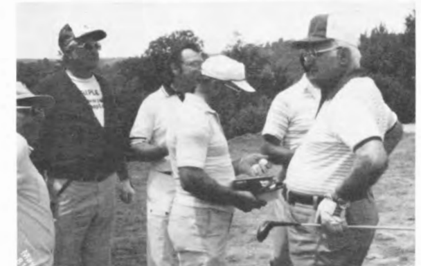
Which way did it go?