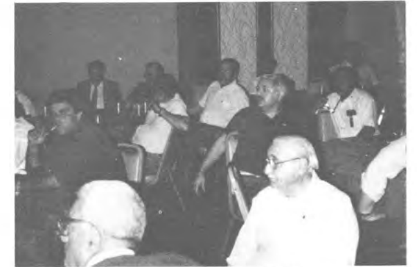
Scene from one of our meetings.