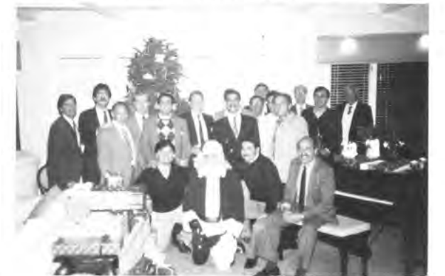
San Diego Brothers with Santa Claus.

All our Brothers are looking forward to atten-