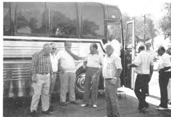
Reno bus trip.