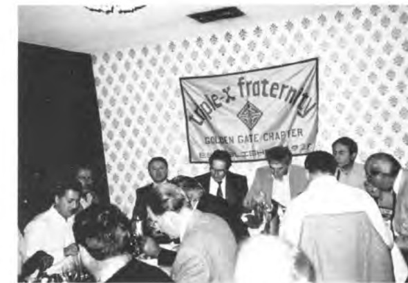
Dinner-Meeting at Golden Gate.