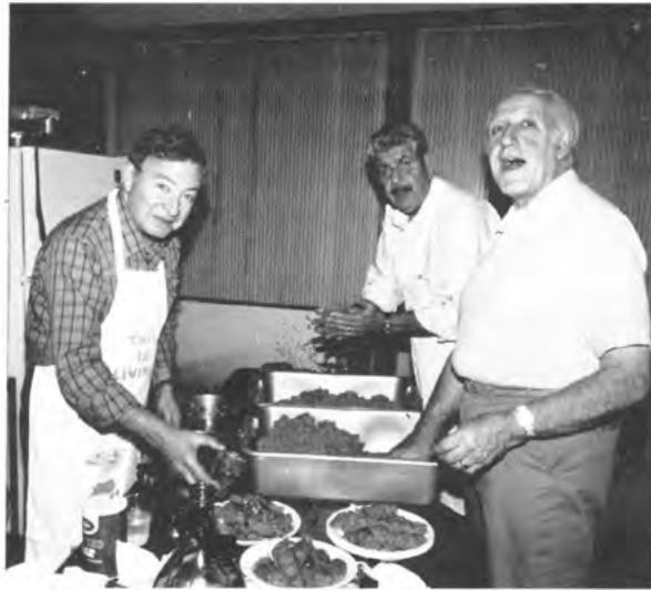
You don't like what...?