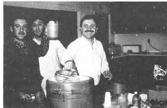
Kitchen crew at Bingo Nite.