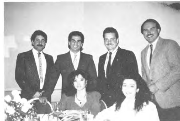
They are all single.