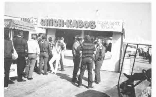
Part of a long line for Shish Kebab at the Farm Show.