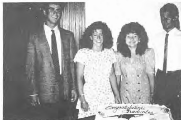
'89 Scholarship recipients.