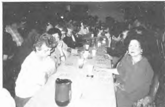
Some of the guests at Bingo Nite.