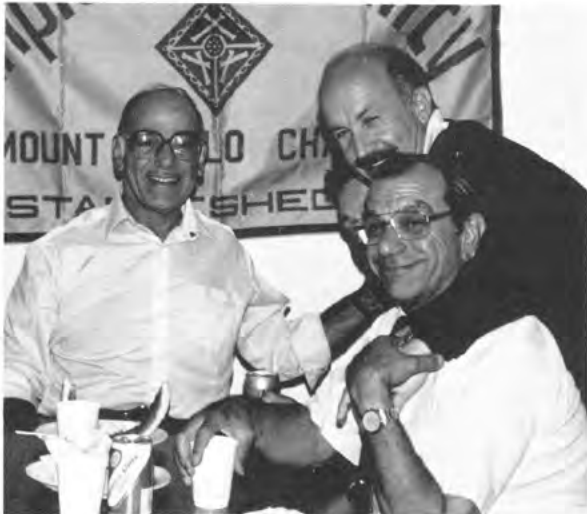
Okay, let's get the meeting started.