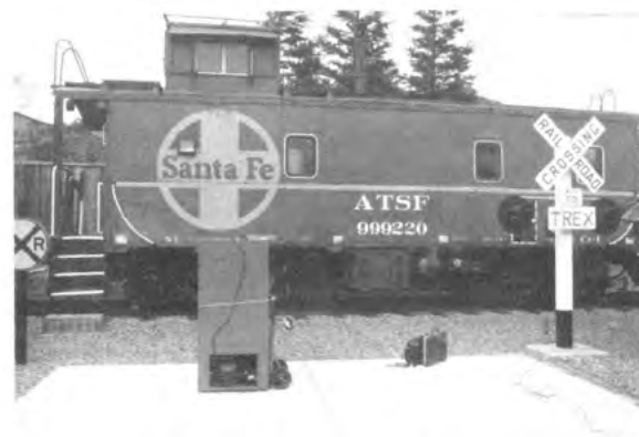
A Santa Fe caboose in your backyard.