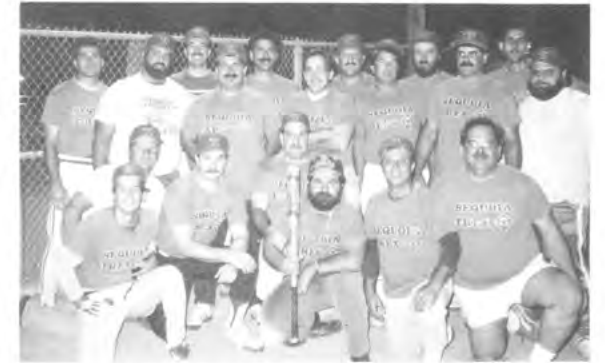
Sequoia Trex Softball Team.