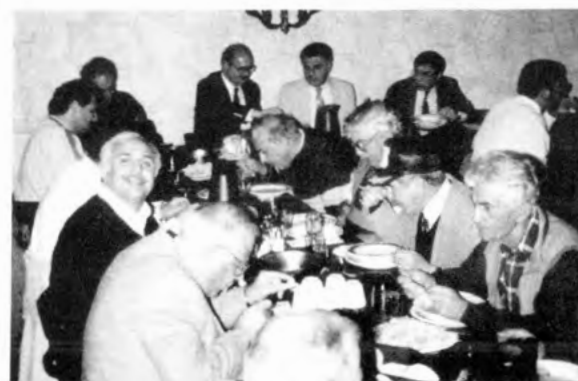
Law Enforcement Night