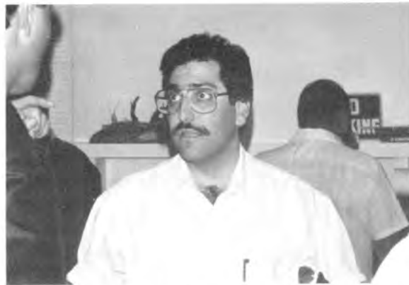
Aram: "What, me worry?"