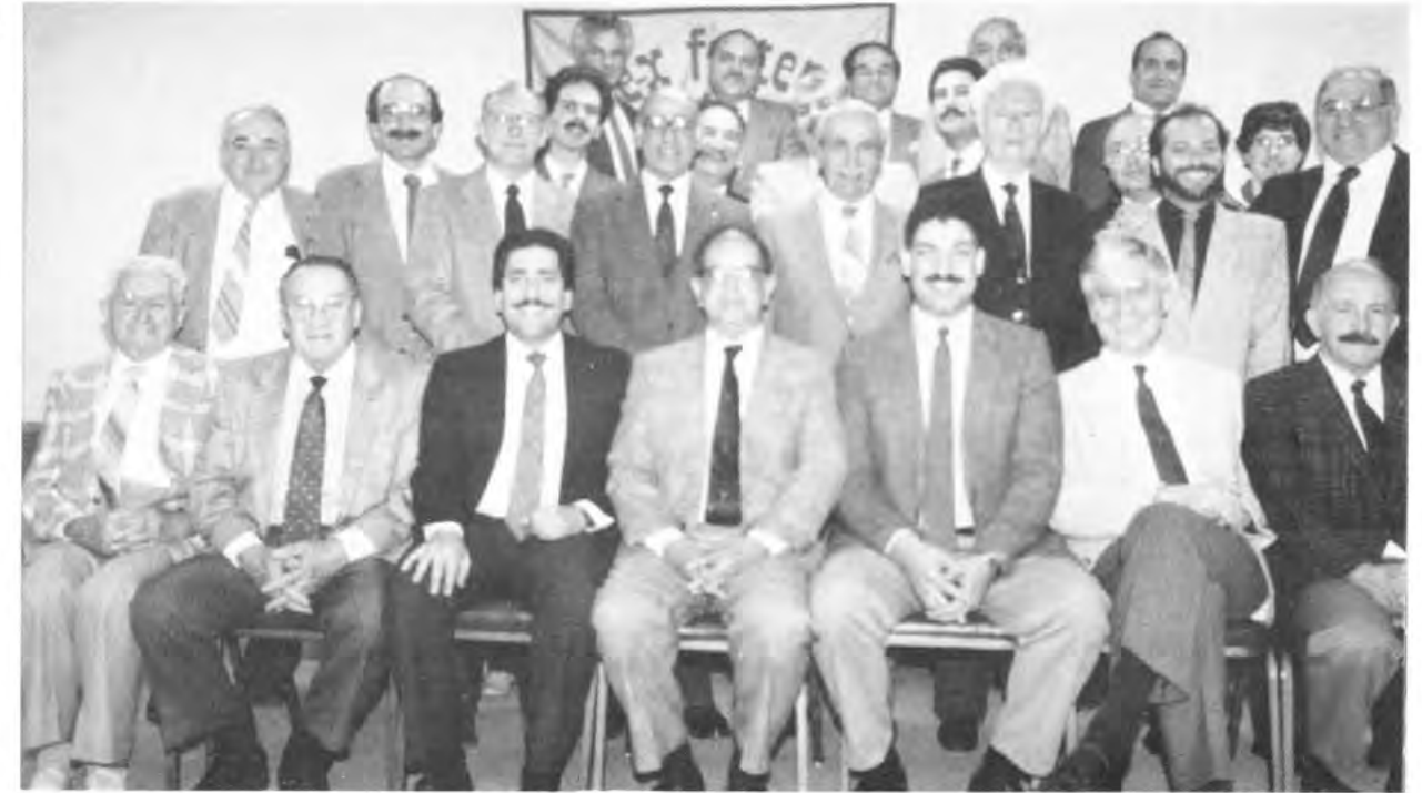
Mt. Diablo Chapter

2571 W. Browning Ave. Fresno, CA 93711 (209) 439-8591; (209) 266-5320