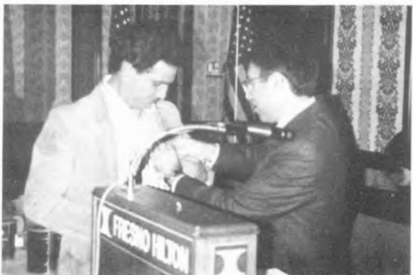
Plaque for Kids Day — Honoring Selma Chapter