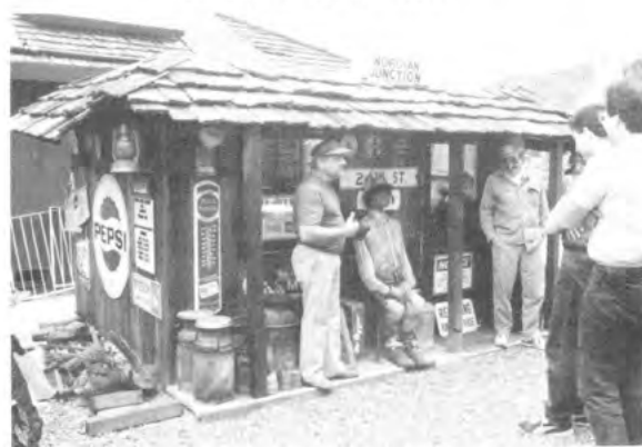
Armen Boyd begging for money at Noroian Station