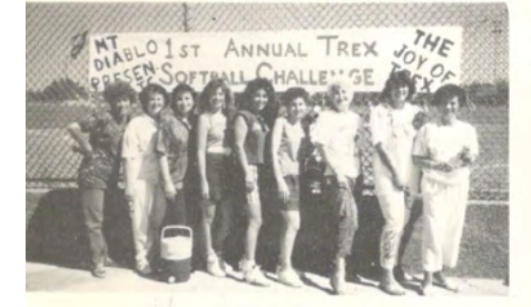
Joy of Trex Women