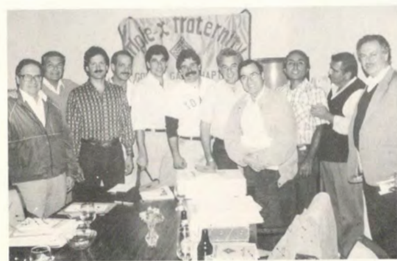
Golden Gate Chapter