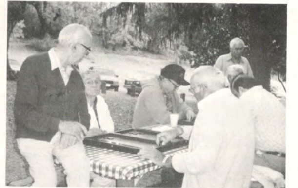
Enjoying Annual Picnic. I wonder what the brothers are playing?