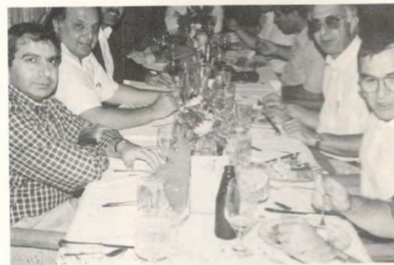
Joint Meeting Peninsula & Golden Gate