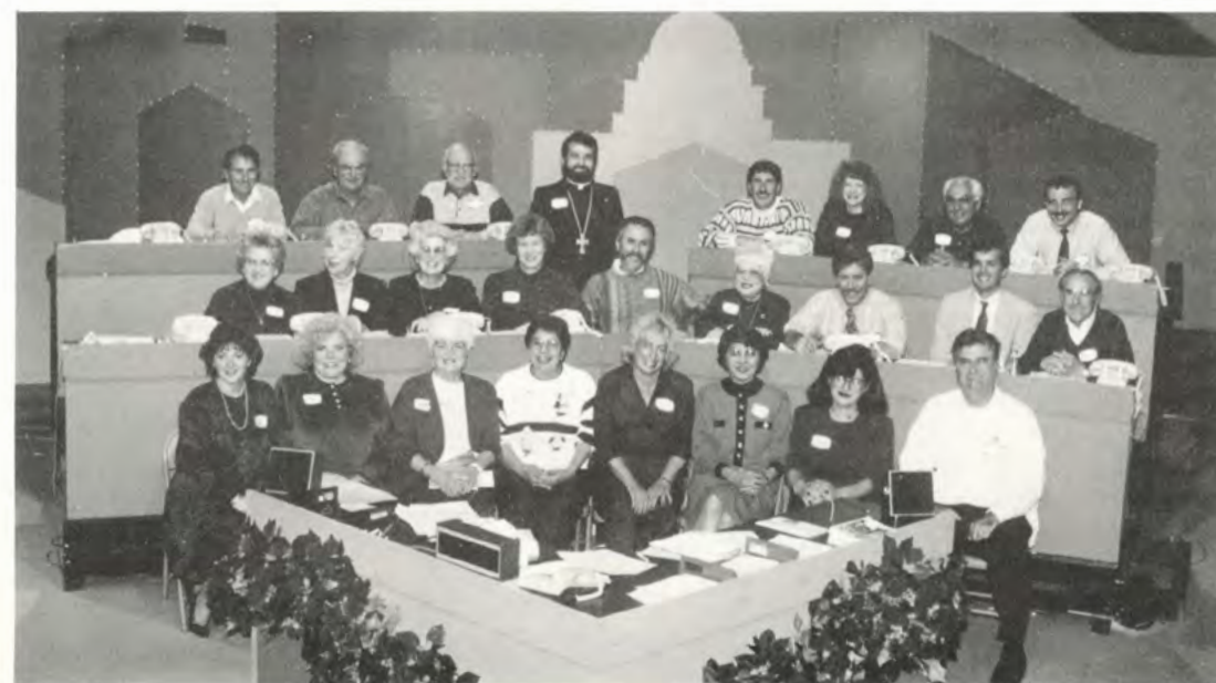
CAPITOL CHAPTER Triple X Fund Raiser Night KVIE-TV Studio.