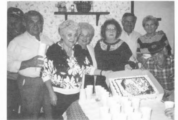
Christmas Party at Fairview