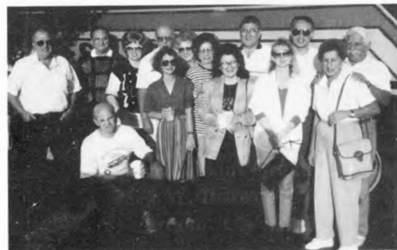
Hye rollers on their way back from Reno.