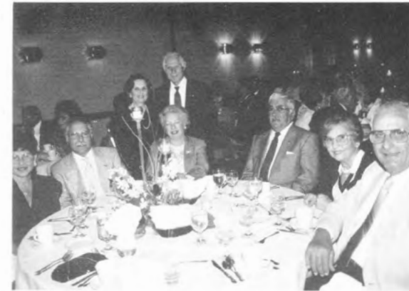
Enjoying the Convention