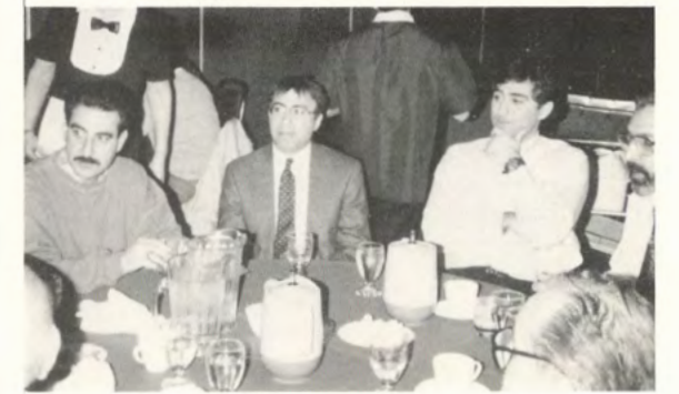
At the meeting.