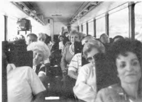
Las Vegas Bus Trip (Had too much fun).