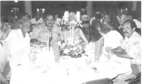
Garden Party Guests.