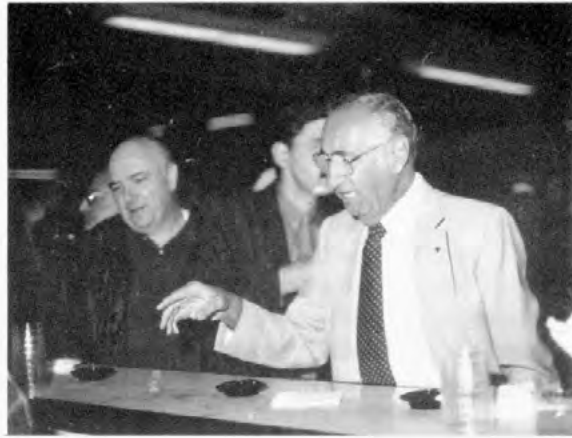
"The other Drunk".