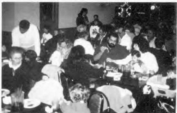
Brothers and families enjoying the X-Mas Party.