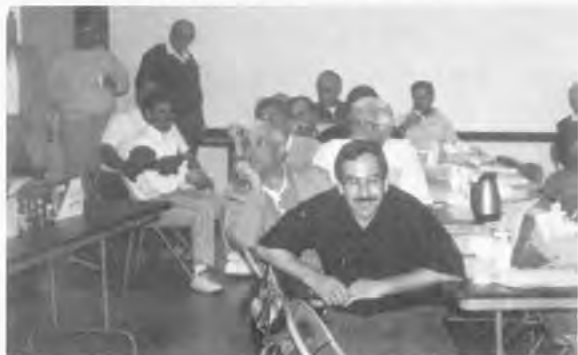
Sequoia Chapter waiting for the Alka-Seltzer after the Mid-Term dinner.