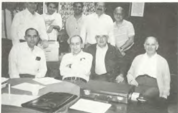
1993 Convention Committee.