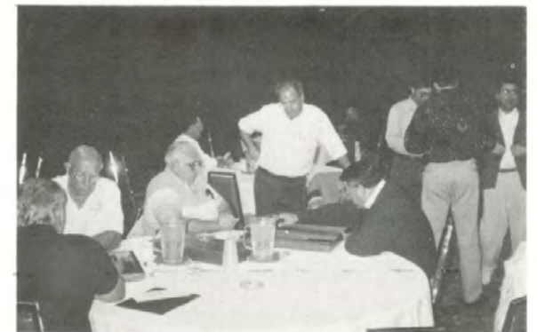
A relaxed atmosphere after a business meeting.