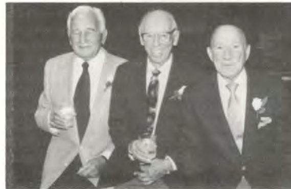
1927 City League Basketball Champs