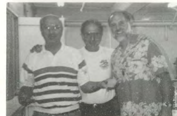
Wanted by the F.B.I., the Famous Bournazian Brothers.