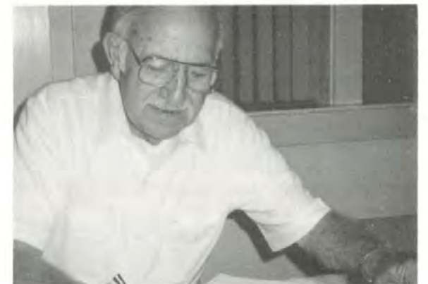
Capitol Chapter, April '92