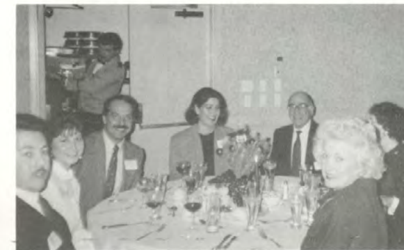
XMas Dinner Party, '91