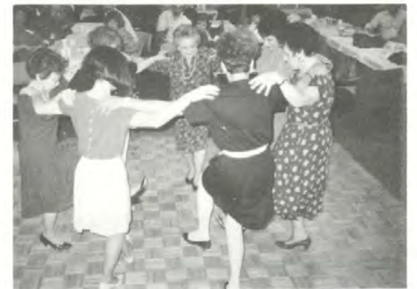
Capitol, April '92