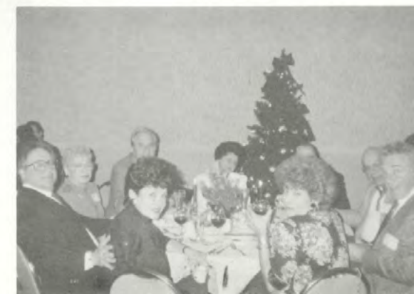
XMas Dinner Party, '91