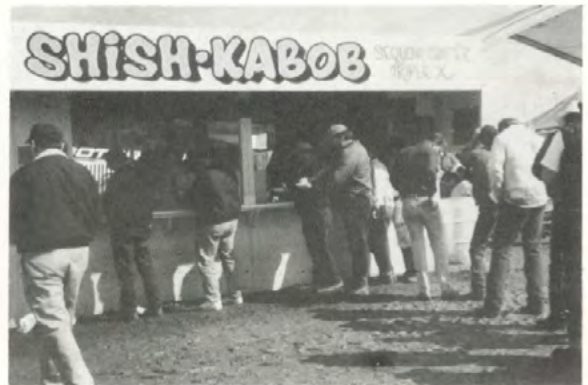
Shish-kebab booth at Tulare Farm Equipment Show.