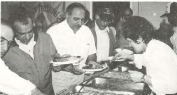
The boys in line for chow.