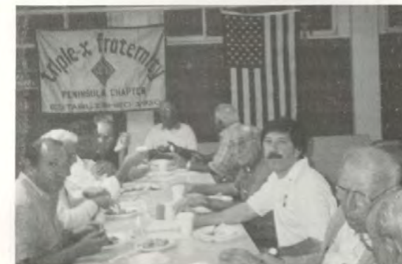
Enjoying one of our dinner meetings.