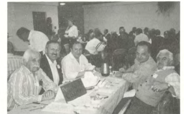
Relaxing at Mid-Term in Fresno.