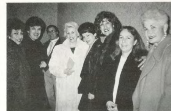
G.G. Chapter Trex Wives