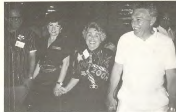
Golden Gate chapter members and wives at the Torrance Convention '92.