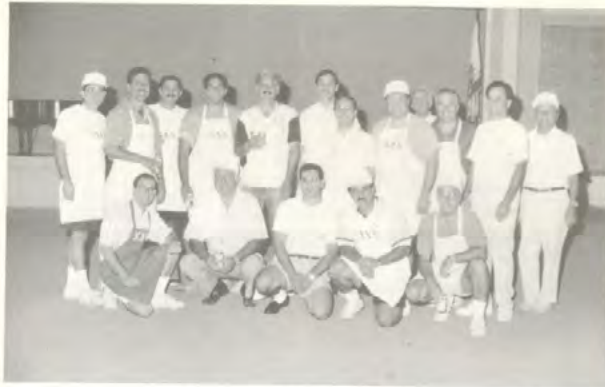
Los Angeles members