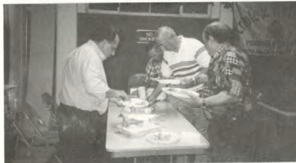
The kitchen's closed—time for some local Asian restaurant food "chowdown".

Shish Kebab, with secret marinade sauce. As always, the legendary Ed Sarouhan Golf Tournament would offer our golfing greats their chance to "have a ball," while the year's activities would be culminated with a heartwarming Christmas Dinner Party (in lieu of one of our more serious Trex business meetings). As for what the future holds in store, gearing up for hosting our 1995 Annual Labor Day Weekend Trex Convention on South Bay turf is what has been well underway, as of this writing. So, until the next exciting issue of Trex News is published, it is time for this communique to come to a close.