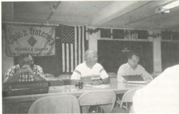
Another "time to get down" Peninsula Chapter Meeting.