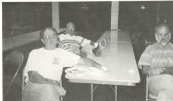
"Kickback time" for the Brothers Bournazian.