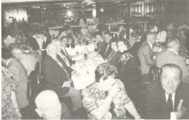
Having a great time at our Installation