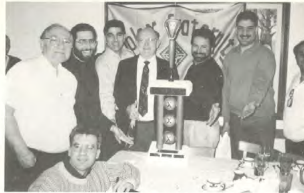
The Diablo Brothers covet the refurbished TREX Cup.