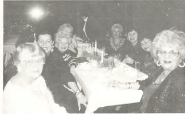
Bro's wives enjoying the New Year's Eve Party.

Our Junior Trex will be having a Las Vegas Night