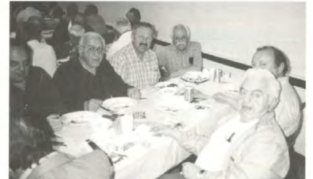
Peninsula Chapter delegates turn out in serious force at '93 Midterm Convention.