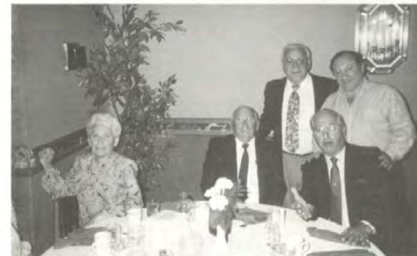
"What? The Spring Dinner Dance is over already? And just when I was getting warmed up!"