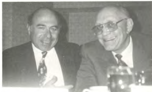
Garo Yepremian, Jerry Tarkanian, Sports Night.