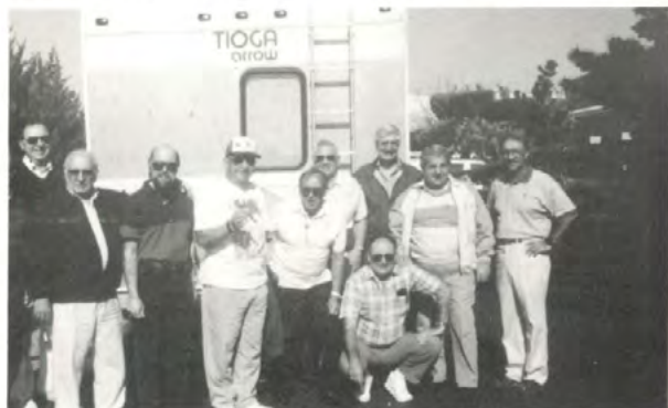
Mid Term motor home ride, what a group.