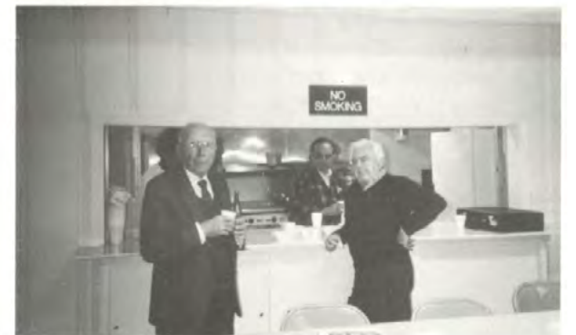
"All right, how long do us Trex Brothers have to wait to get the good stuff around here?"