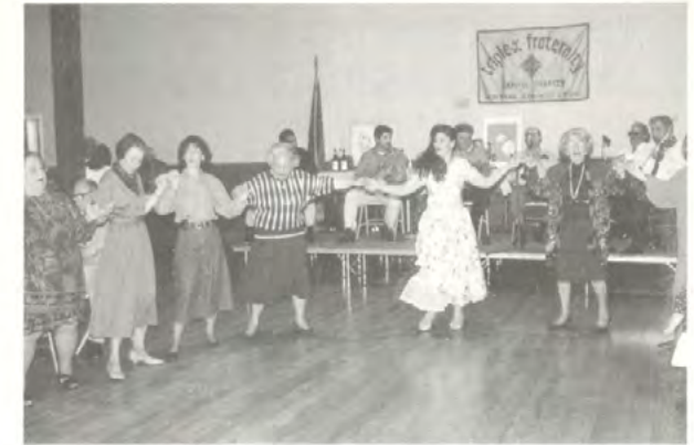
Kef Night June 1993.