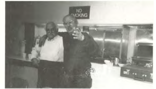
A perfect example of genuine Trex camaraderie right here!