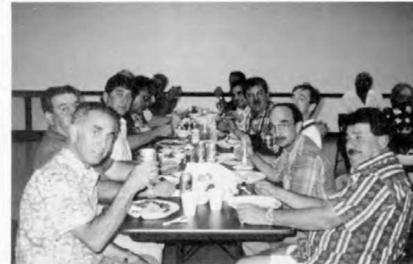
"Not so Old Timers"