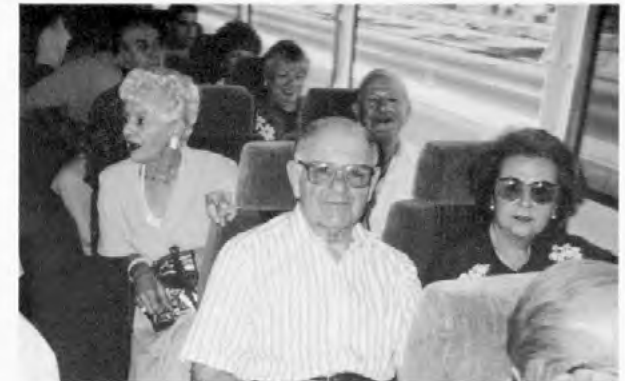
Mystery Trip Bus.

pulled into the Bass Lake- Sierra Pines Resort. From the parking lot we walked down to a beautiful outdoor dining area set along the Bass Lake shore (see pictures). Everything was First Class and everyone wants to make this an annual affair.