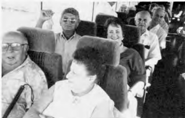
Mystery Trip Bus.