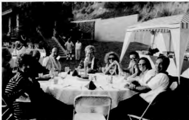
Mystery Trip at Bass Lake