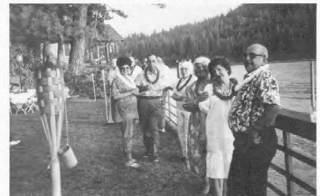
Bass Lake Mystery Trip.

September 2, 3, 4, 5 our 76th Annual Convention was held at the Plaza Park Holiday Inn, Visalia and excellently hosted by our Sequoia Chapter Bros. The new Grand Master for the