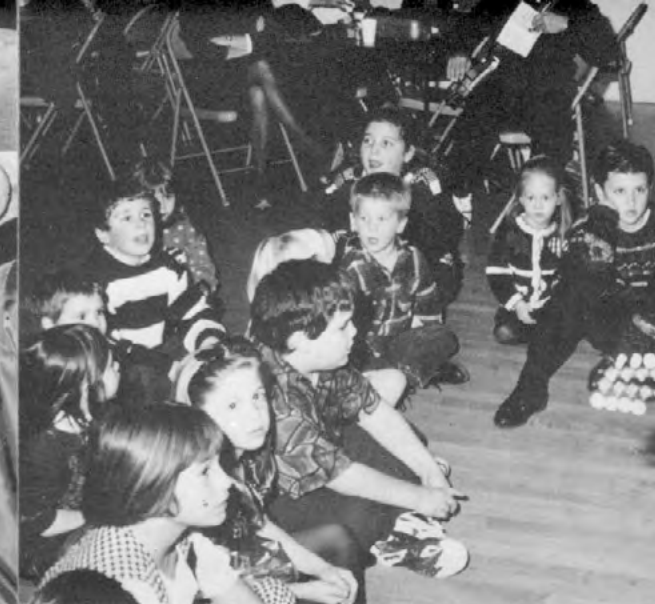
Children's Christmas Party.