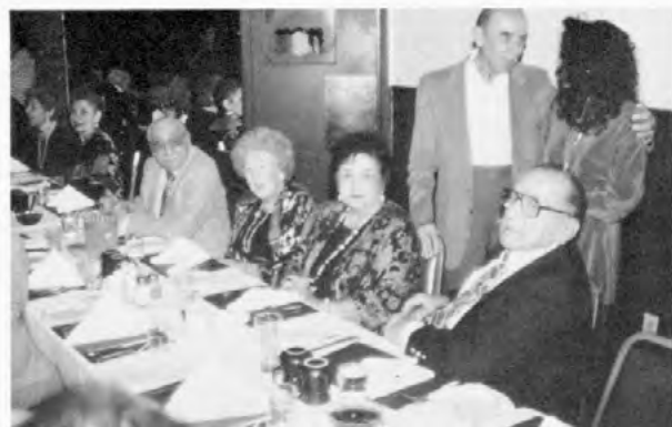
Joint Installation Dinner at the Players.