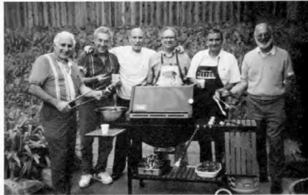
The Shish Kebabers.