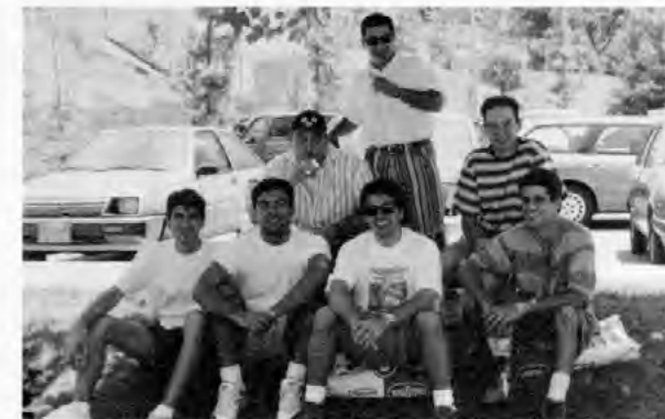
The Los Angeles Juniors.