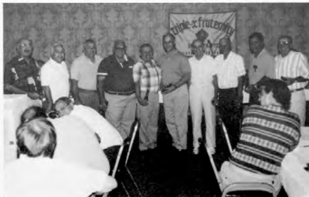
Membership team captains