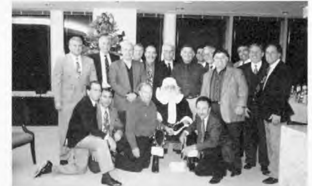
San Diego Bros. at Christmas Party