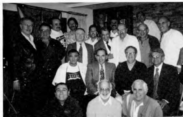
Oct. 5, 1994 Meeting with Grand Master