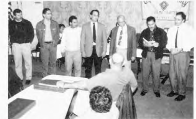
Four New Brothers being Initiated.