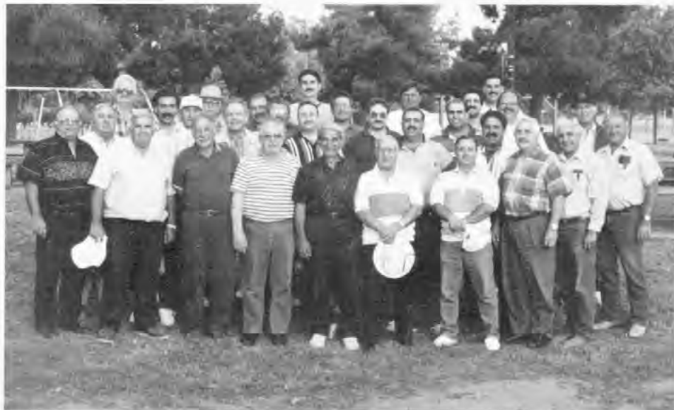
Outdoor Dinner Meeting.

Our joint dinner meeting with Fresno and Selma chapters was another success. It's always good to see members from various chapters. Lately, we've been having outdoor dinner meetings. It's a nice change of atmosphere. Brothers