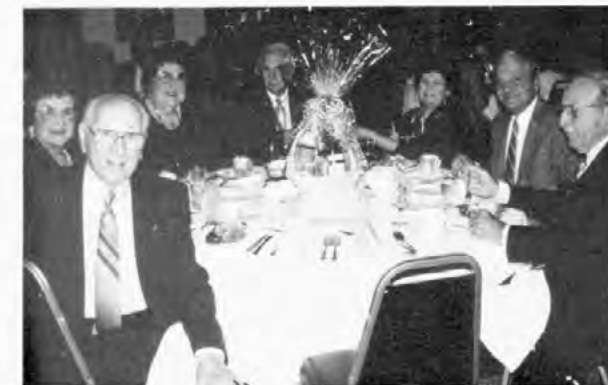
Roopenians, Khtelans, Pariglans.