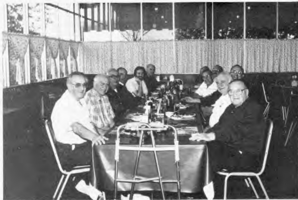
Bro's Pre-meeting Dinner.