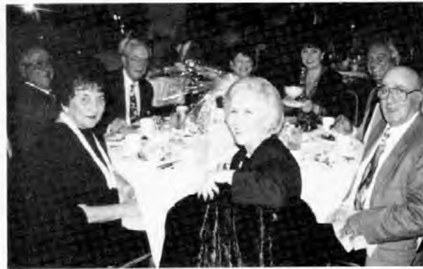
Poladians, Neshanians, Avedislans, Poladians.