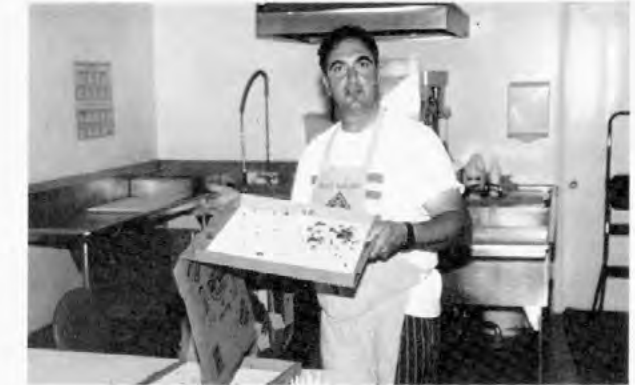
No more pizza left!

ments and how much scholarship means to a young High School graduate.