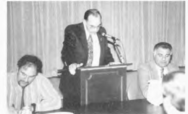
Law Enforcement Night.

In April, many Trexman from Selma and Fresno Chapters joined together for a day of Golf at Fig Garden Golf Course and dinner at