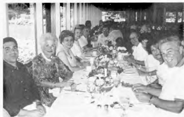
G.G. Chapter Sunday Brunch Sausalito.