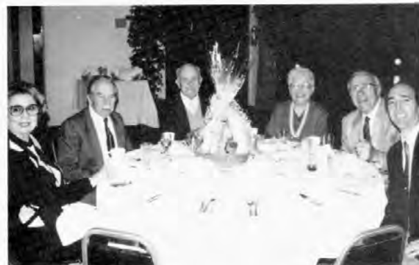
Masons, Elmasslans, Hovsepians.