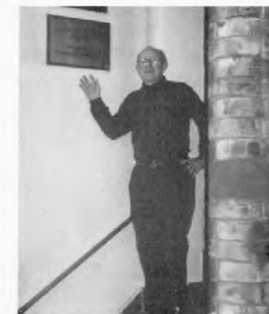
Tanil In England