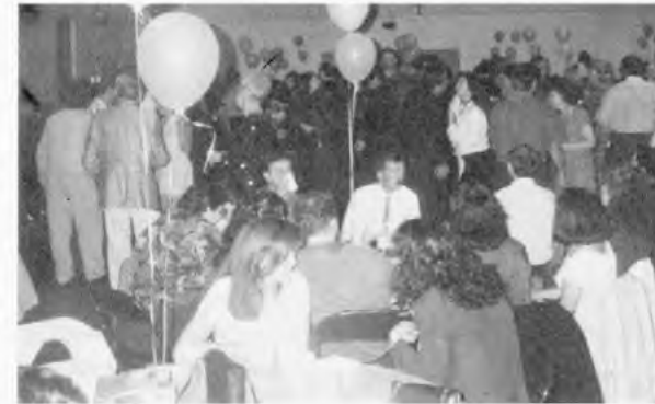
Spring Dance - "Kef time Orange County Style".