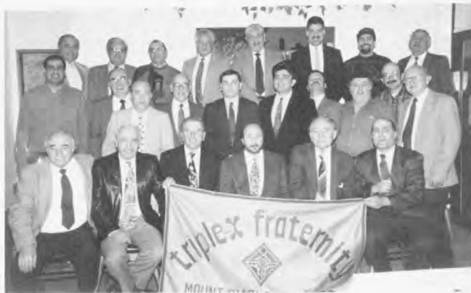
1994-95 Mt. Diablo Chapter