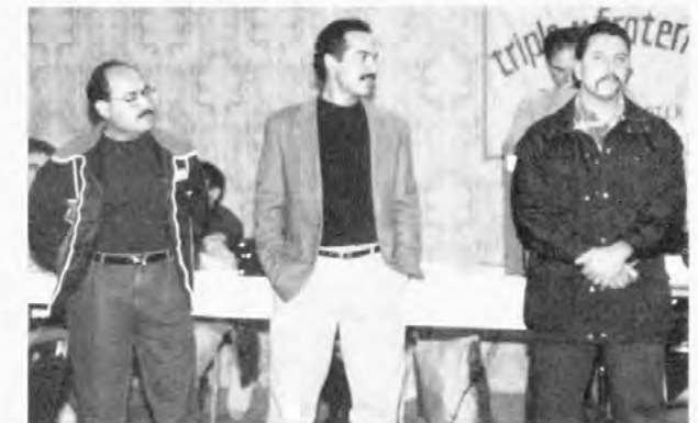
Three New Brothers joining the fraternity.