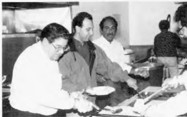
Spring Bingo Kitchen Help.