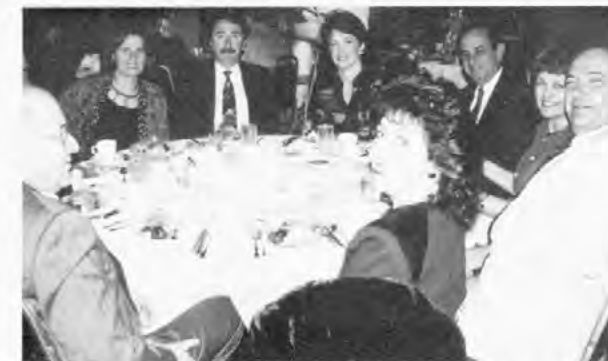
Roopenians, Jebejians, Dagermangys, Kalfalans,