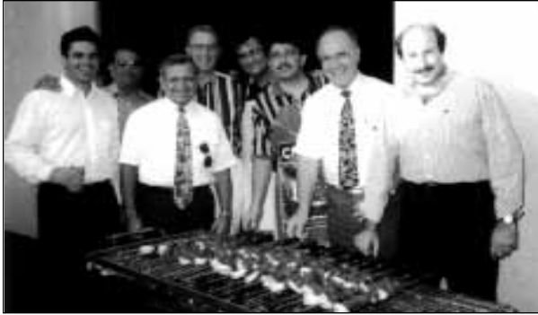
The whole gang is cooking