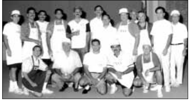
Some of the "boys" working at the Ararat Home Picnic.