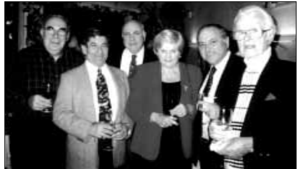
Attendees at Christmas Party