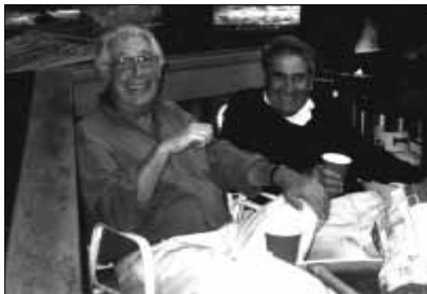
We're having a great time!