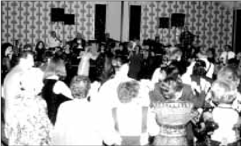
Kef Time in Las Vegas