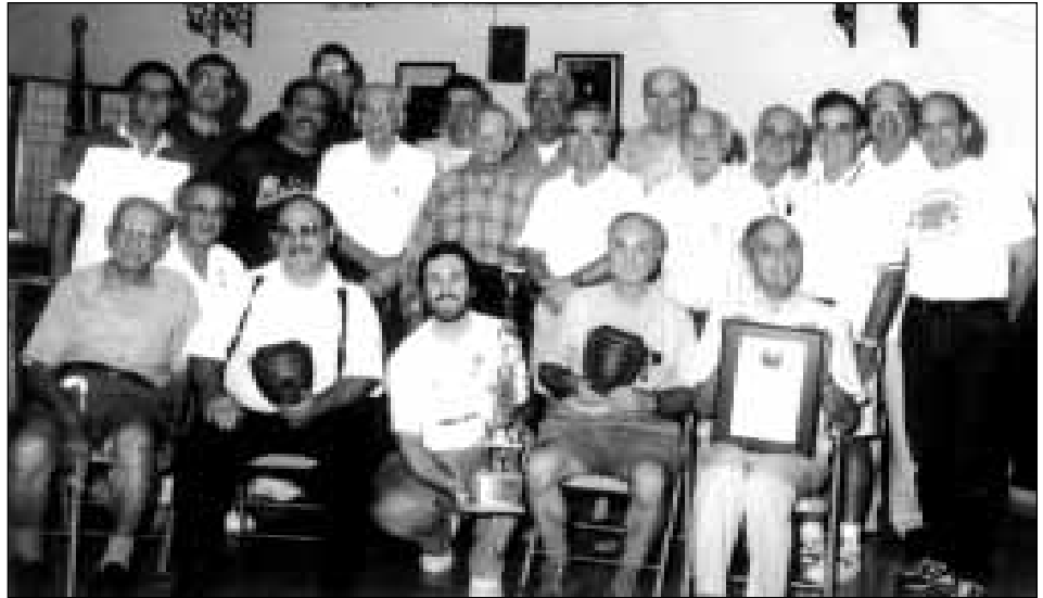
Capitol Chapter, 1997 Achievement Trophy Winner with 25 and 50 year plaque recipients.

January 1998 Congratulations Brothers, we won the Achievement Trophy for 1997-98. With our great Kef Night, Ladies Affair, Picnics, Masters Dinners, Charitable Donations of $10,000 and outings we did OK. Thank You. Our annual gathering of Trexmen and their ladies, dined at the Buckhorn Restaurant