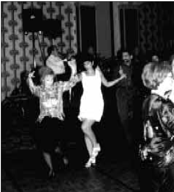
Kef Time in Las Vegas