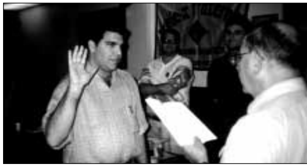
Swearing in a great new Oakland Chapter member