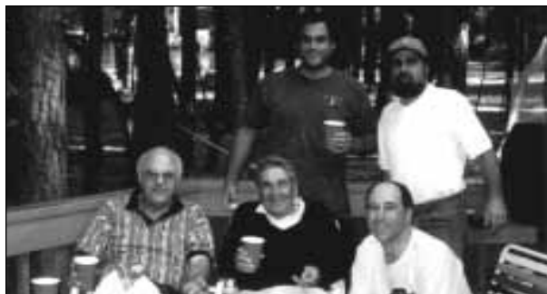
Oakland Chapter members enjoying each other's company.