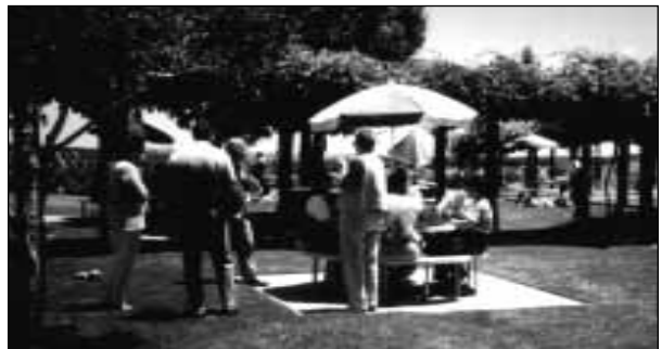
Mystery Trip Luncheon Arciero Winery