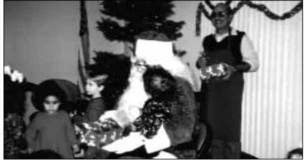
Christmas Dinner Santa and kids