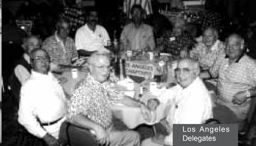
Los Angeles Delegates