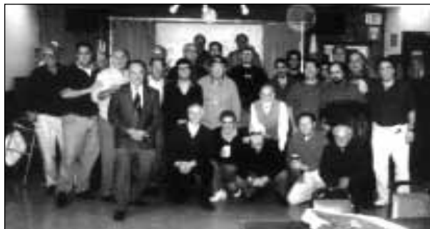
Oakland Chapter poses for a group picture.