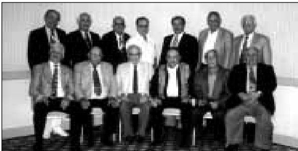
Past Master who received pins at Banquet