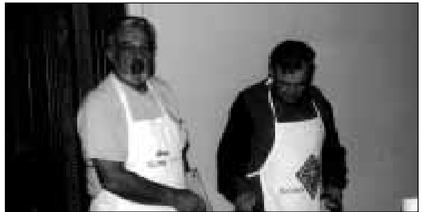
Lamb Shanks - Chefs at Work