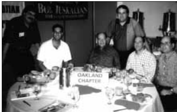
We're hungry, let's eat!

We also had a wonderful time celebrating Christmas at the historic Presidio country club