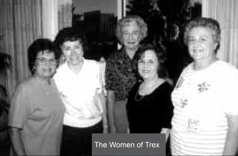
The Women of Trex