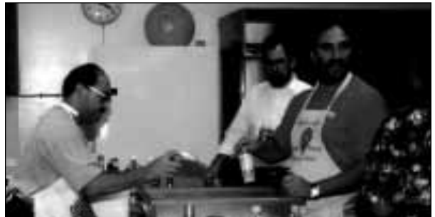
Selma Chapter Kitchen Crew