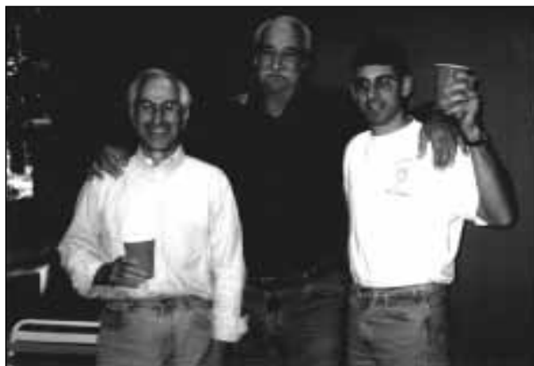
Oakland Chapter members in full force at the San Diego Convention.