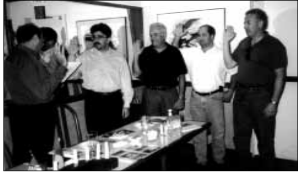
New officers being sworn in