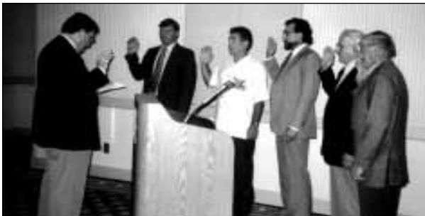
Grand Master swearing in Officers