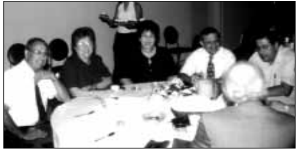
Selma Chapter Scholarship Dinner