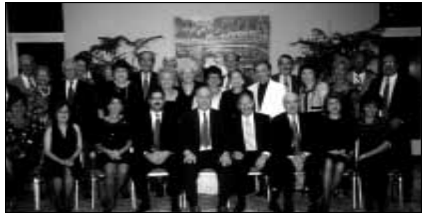
Bro’s & Wives, San Diego Convention