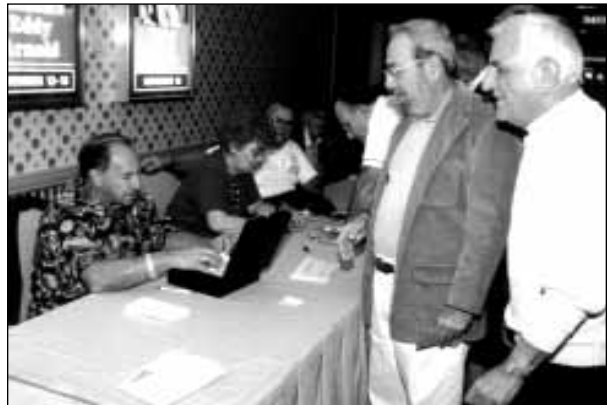
PGM Mooney selling tickets