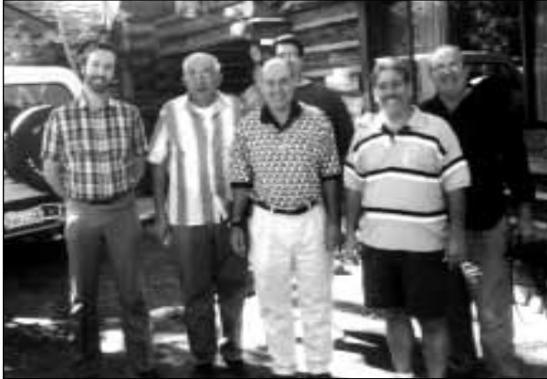
Lake Tahoe Outing