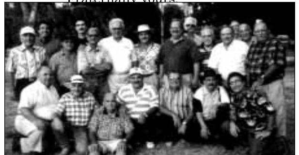
Sequoia Bros. at Picnic Meeting Visalia