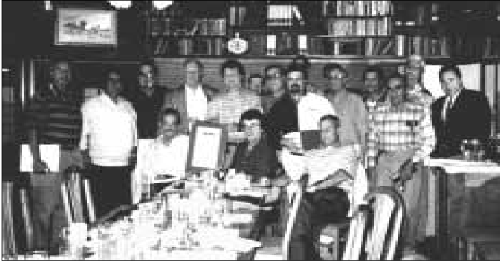
New Brothers from Palm Desert,