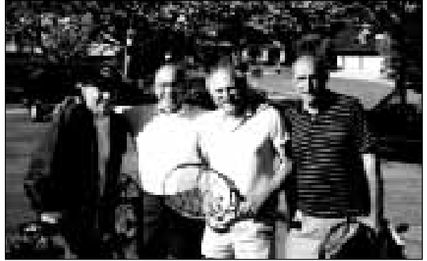
Mt. Diablo Tennis Team