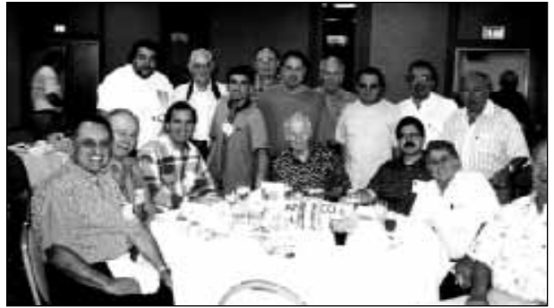
Bro's having fun - LA Convention.