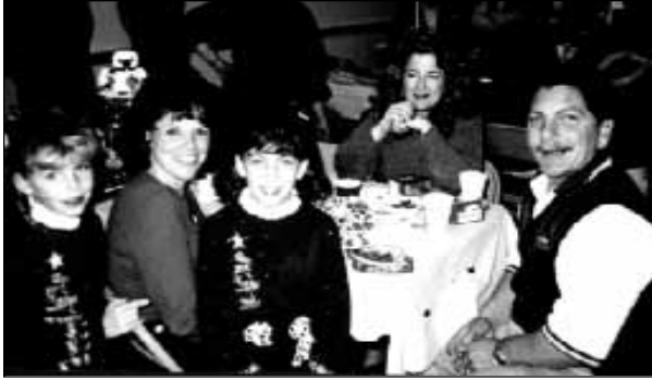
Christmas Party - Merry Christmas