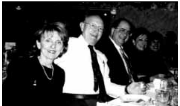
Attendees at Christmas Party