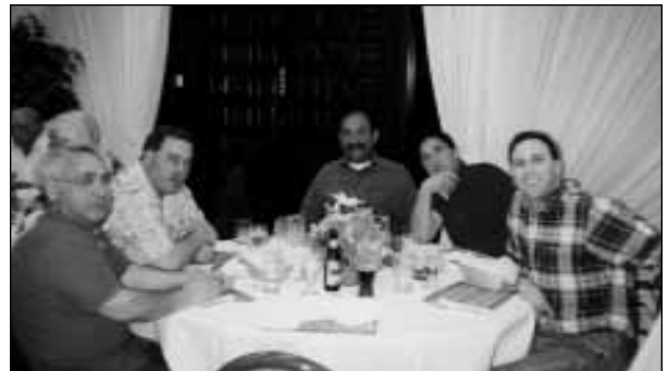
Dinner meeting at Javiers Restaurant