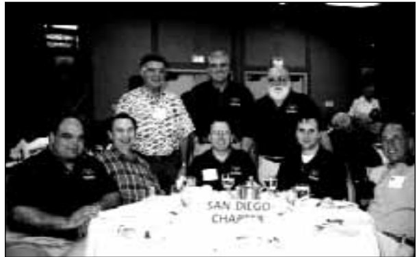
San Diego Chapter delegates at the 1998 Convention.