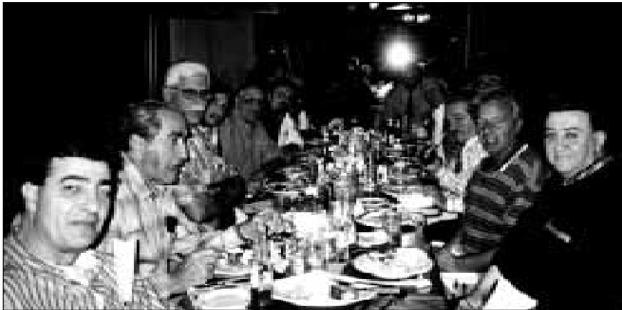
Palm Desert Dinner Meeting