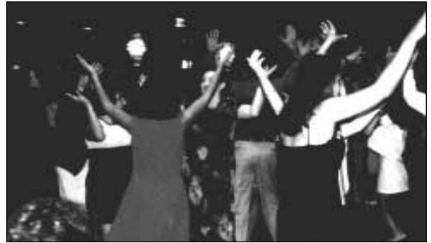
“Hallelujah”! Armenian dancing at Convention.

Labor Day Weekend was our Annual Convention. This year's, convention proved to be one of the highlights of the year. The setting at the beautiful Universal Sheraton, provided attendees with both first class accommodations and plenty for members and their families to do. Highlights of the weekend started Friday with our spectacular Monte Carlo Night complete with Armenian mezza, swing dancing, and of course plenty of gambling. Many members were not