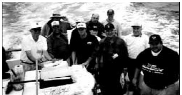
Bro's never got sick and caught lots of fish.