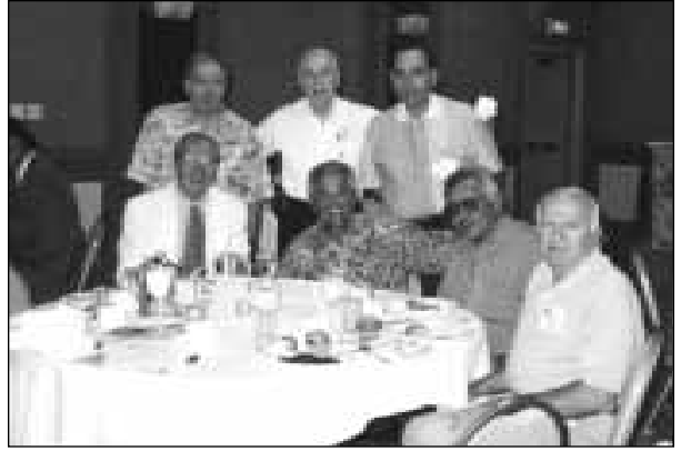
Fresno Brothers at L.A. Conventioin.