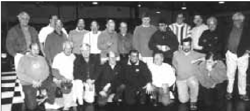
Mt. Diablo and Oakland Chapter members