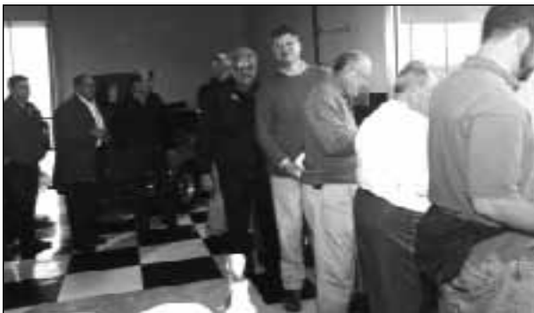
After dinner I'm buying a car