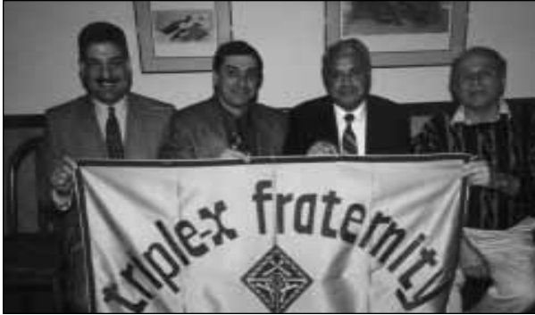
1998-99 Mt. Diablo Officers