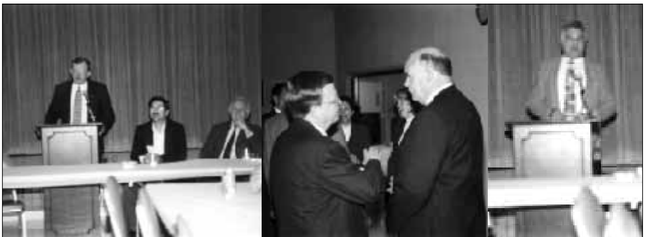
Law Enforcement Night

In the month of April our chapter held its Annual Scholarship Dinner where we honored