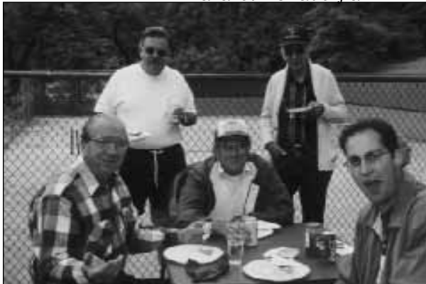
Bass Lake - Snack time.