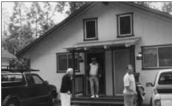
Bass Lake - Chalet.