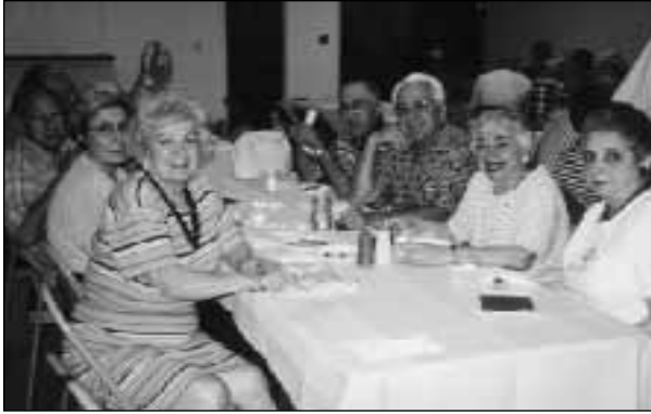
Open Social - Sheriff Night, Happy supporters.