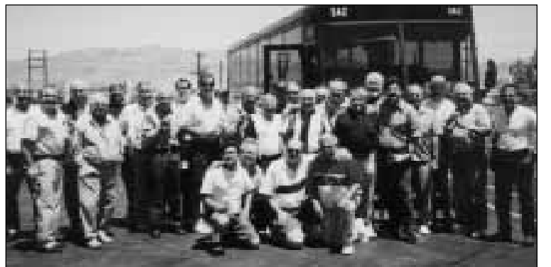
A Big Fun Trip to Laughlin. Bro's and guests.