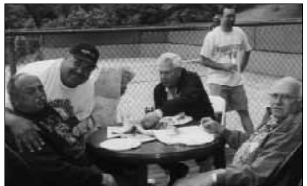
Tennis Anyone? Bass Lake.