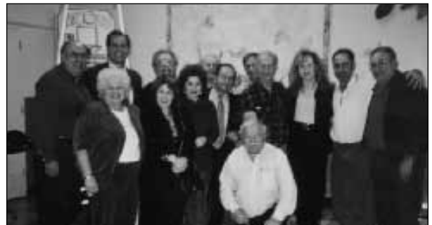
Brothers and wives at Development Center Party.