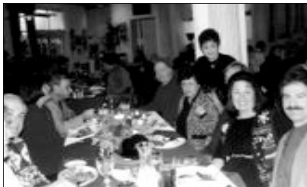
Triple X Holiday Kef

In October, we held another Prospective Member night at Osko's Restaurant, where some desert residents were able to come, participate