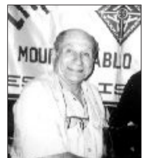
Outgoing Master Garo