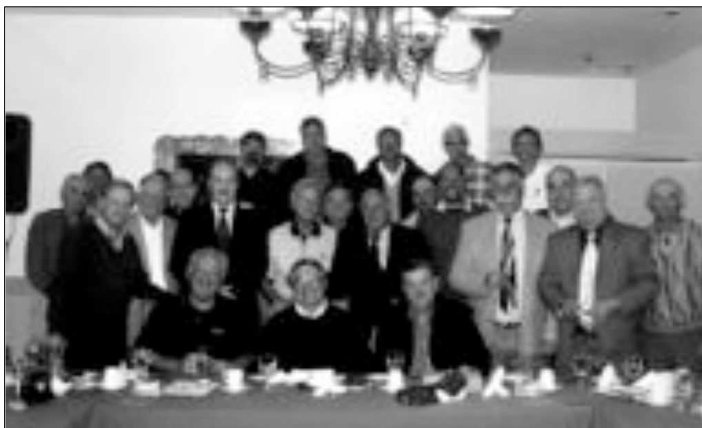
Palm Desert brothers and guests at December Meeting

On December 16, 2001, we had a very successful Holiday Kef, which was held at the Olympia Restaurant. Desert Trex brothers, families and