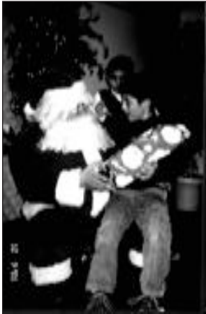
Where is Santa?