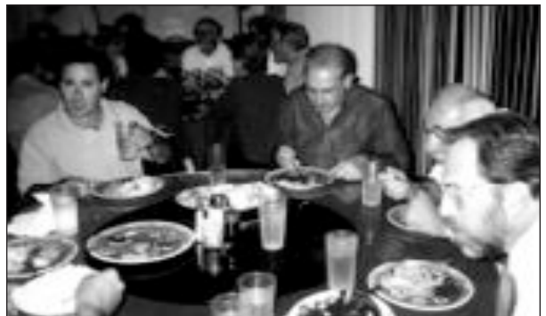
DINNER MEETING: Ming's Chinese Restaurant