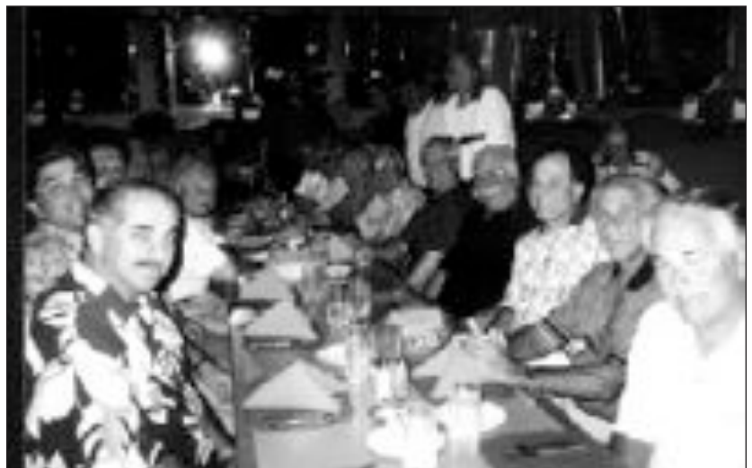
Bros from various chapters break bread together at our annual stag outing at Lake San Marcos.