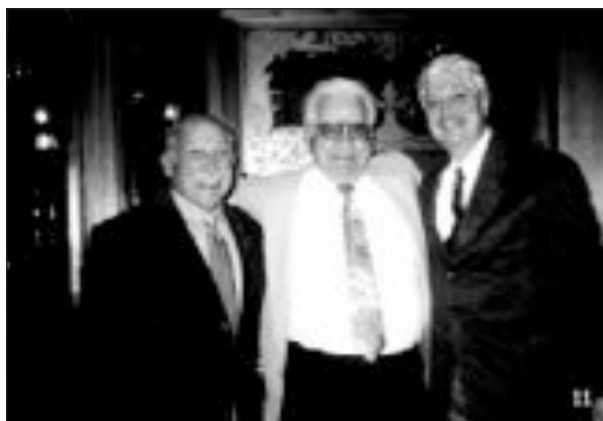
Three Great Trexman

Our next outing was our monthly picnic in Visalia, Tulare, Dinuba and Kingsburg. The brothers in charge serve a variety of foods from steaks, shish kabob, lamb shanks to good ol'e BBQ chicken with trimmings.