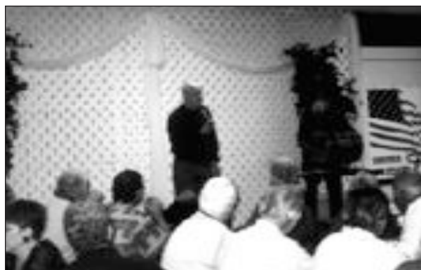
Jerry Tarkanian tells it how it is.