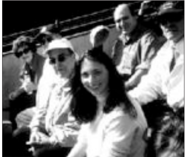
GG Bro's at Giants Game