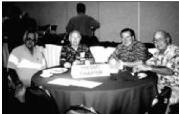
XXX Convention Mt. Diablo. Fresno Delegates Sept.