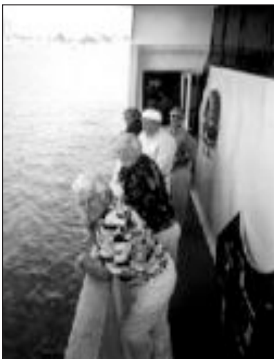
A few Bros contemplate jumping overboard during the Wives Night Out cruise after the chartered yacht rammed the Coast Guard Cutter.

In October we held our annual stag outing at Lake San Marcos, where the event was attended by Brothers from all 78 Chapters. Basically what this weekend boils down to is three days and two nights of golf, cards, TV, Tavloo,