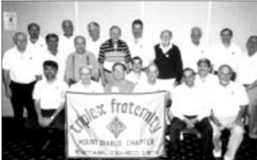
Mt. Diablo brothers at convention