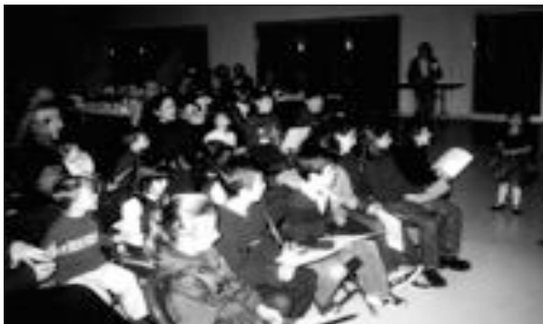
XMAS PARTY: Everyone wants to know where's