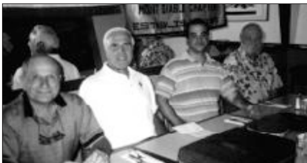
Mt. Diablo Chapter officers