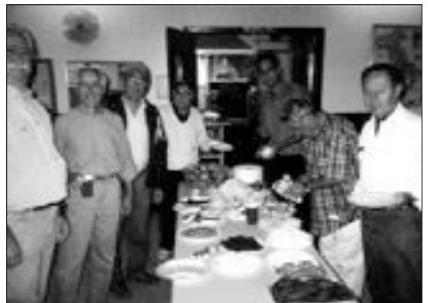
Oakland Brothers hovering over mezza waiting to attack.