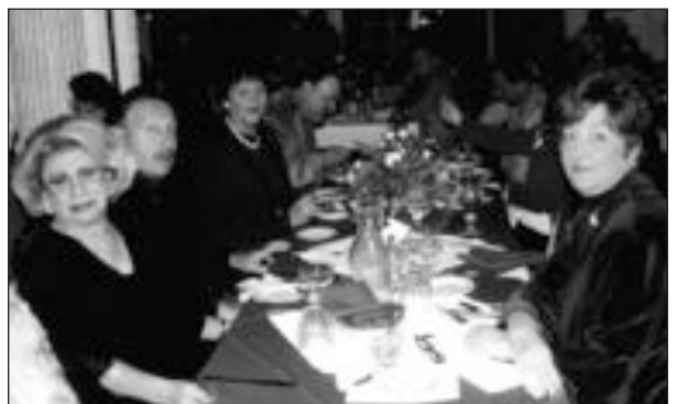
Triple X Holiday Kef