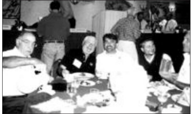
Breakfast at the business meeting