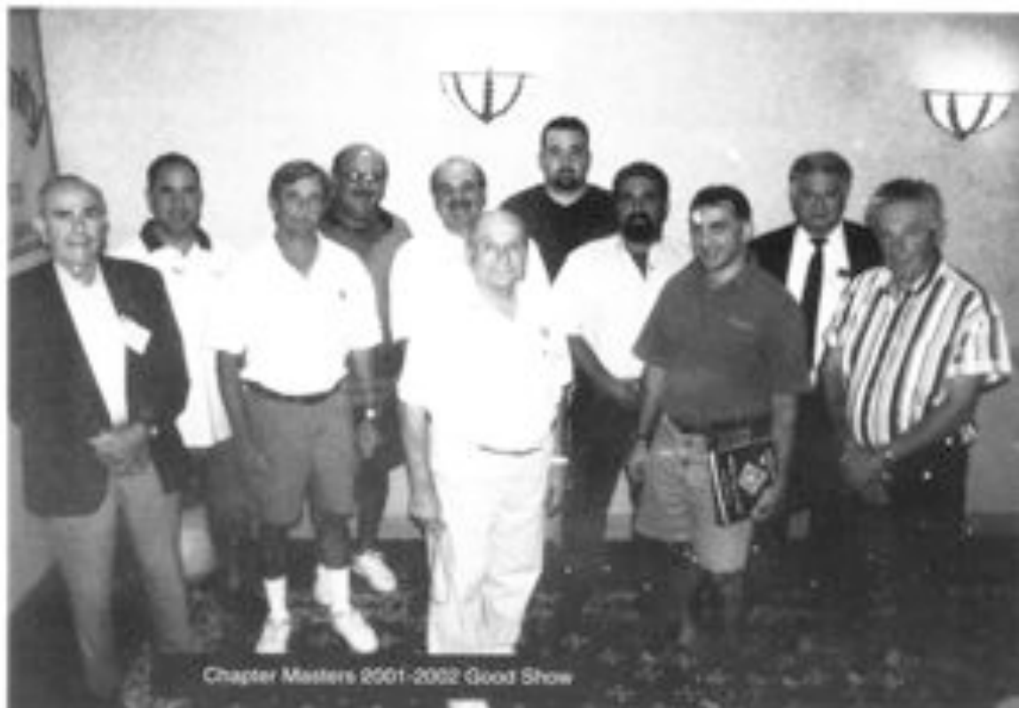
Chapter Masters 2001-2002 Good Show