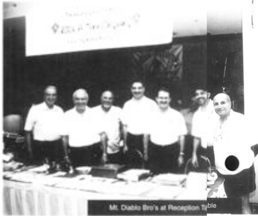
Mt. Diablo Bro's at Reception Table