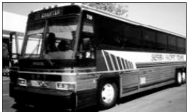
Wine country tour bus