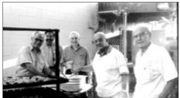
B-B-Q Time in Fresno