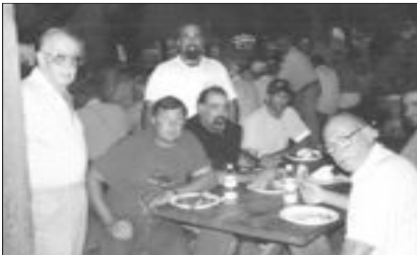
Brothers enjoying Kingsburg lamb shank dinner-meeting.