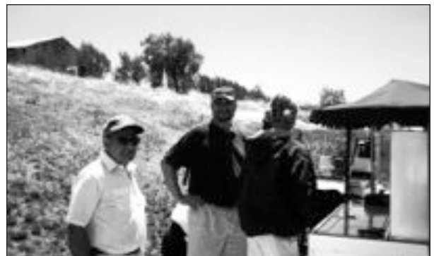
Golf Tournament Refreshments.