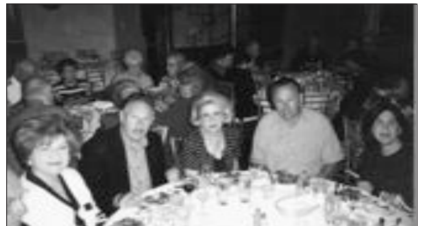
Wives Night Out.