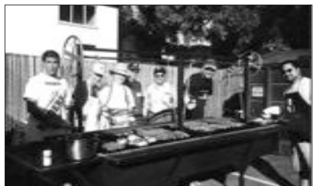
Oakland Trex BBQ