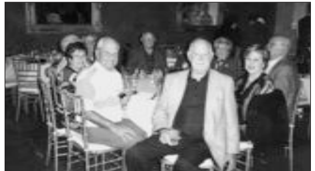
Wives Night Out.