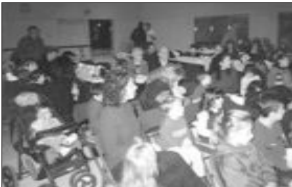
December Christmas party