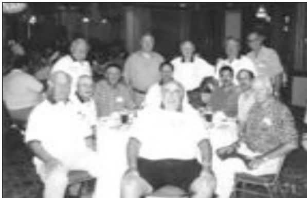
Selmas Convention 2002 - Good looking Brothers.