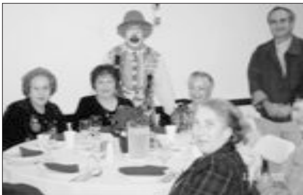
Clowning around with adults.