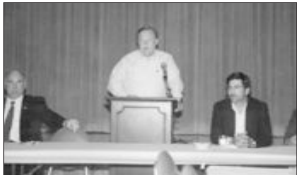
Law Enforcement Night.