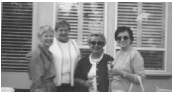
Brothers Wives enjoying themselves.