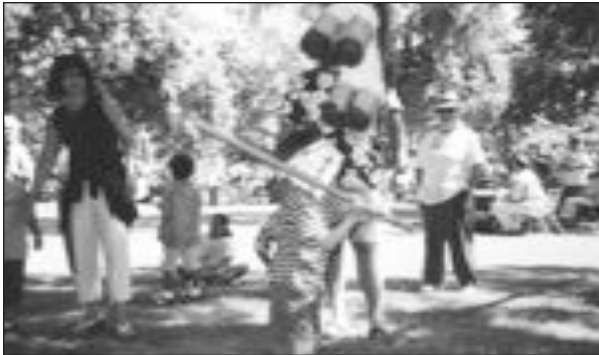
Annual Picnic. Kids having fun.