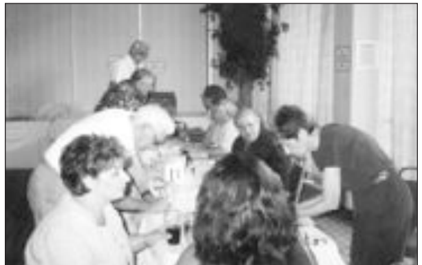
Convention 2002 Registration