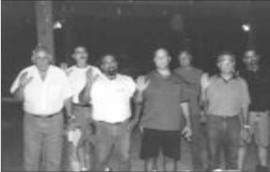
New corps of officers for 2002-2003.