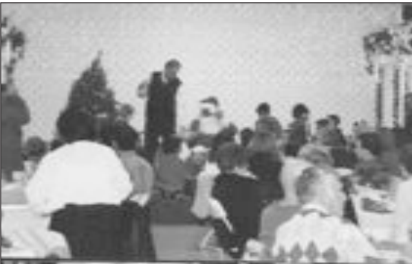
Fresno Christmas Party