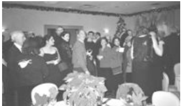
Christmas Party arrivals

games. The large number of baby strollers in attendance gives this editor reason to believe that members have also been busy expanding their families in between the annual picnics.