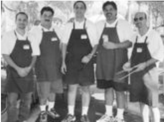
Ararat Home Picnic