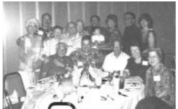
Mt. Diablo Brothers and wives at Fresno Convention.