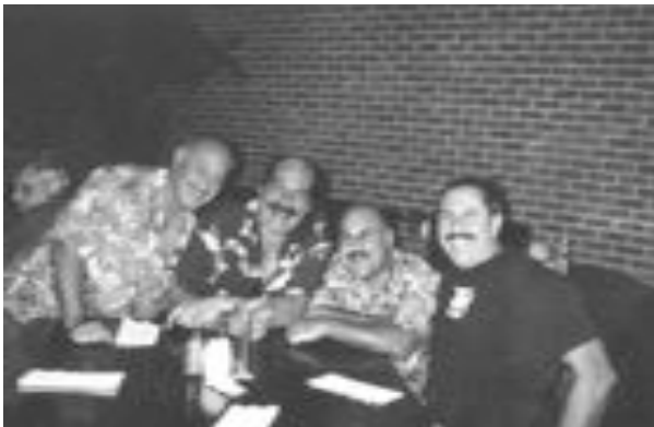
Brothers having a great time