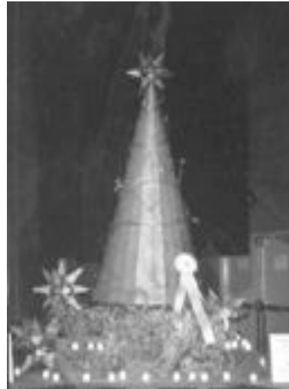
Bro. Pete Zerounian creation of Christmas tree.