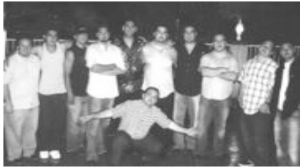
The 2004 Orange County Junior Triple X