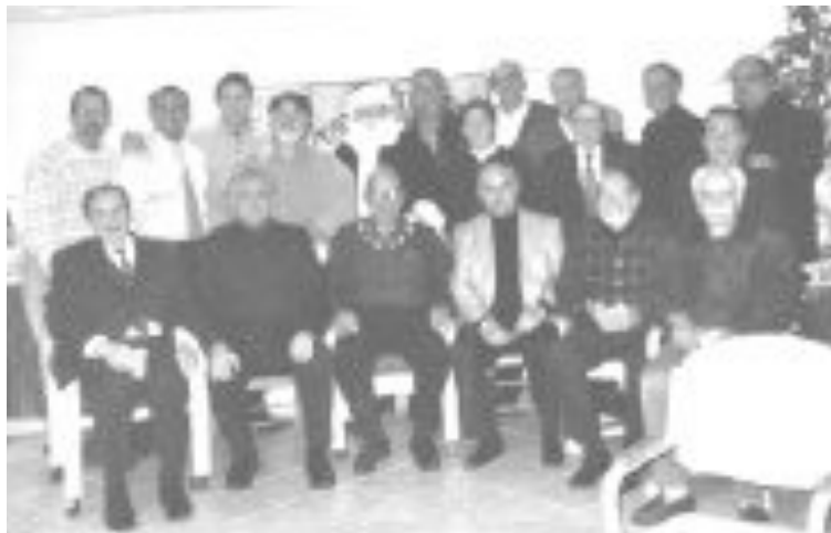
The Triple X San Diego Chapter and our guests, Grand Master and Junior Grand Master at the Christmas Party 2004.