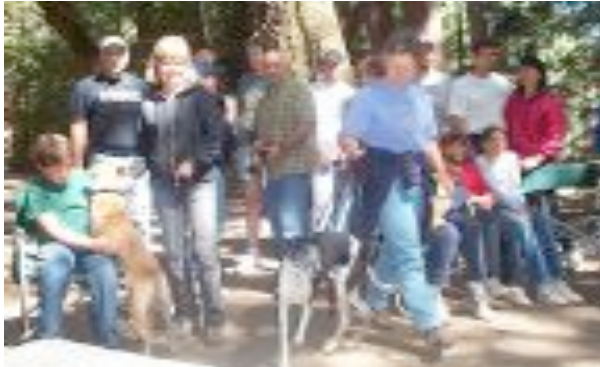
Relaxed and Satisfied Campers at Big Basin State Park

As time goes on we have all noticed a sense of camaraderie build between families. It's an event we all look forward to.