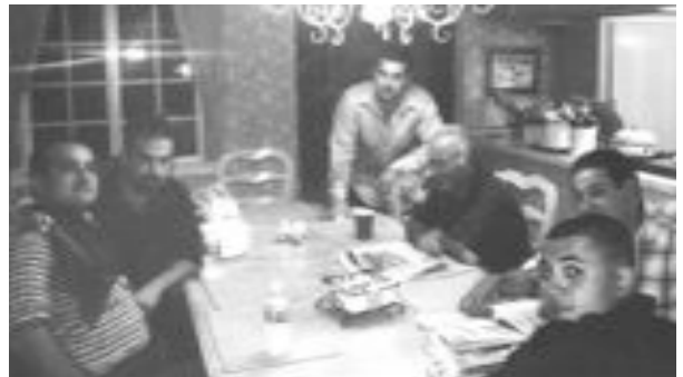
The Brothers enjoying a drink.