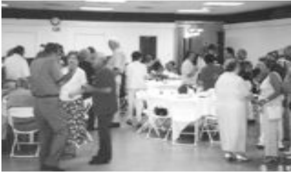
Friday Welcome at Clubhouse.