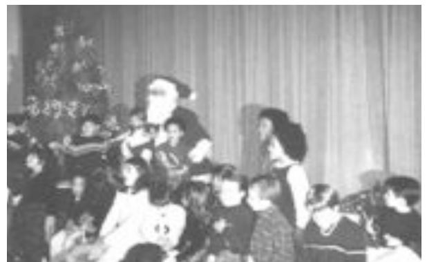
Santa and little friends