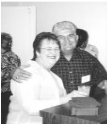
Friday Welcome Night.