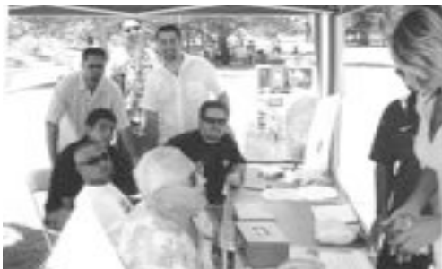
Brothers at the Annual Senior Picnic