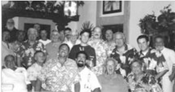
Palm Desert Chapter Brothers at a Meeting

Golf Outing”, will be held on April 29 th and 30 th . Everyone is invited to come down and enjoy our Desert and participate in these events. Our brothers look forward to your visits and also to seeing everyone at the annual Midterm in Fresno and this year’s Convention in San Diego.