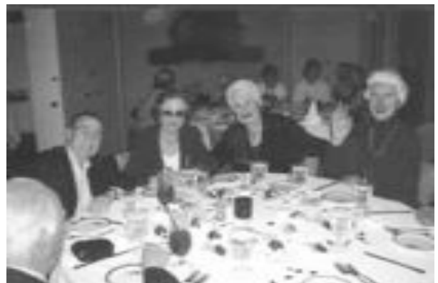
Valentine's Day Dinner