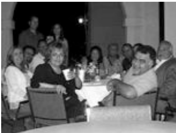
PALM DESERT GOLF WEEKEND 2007