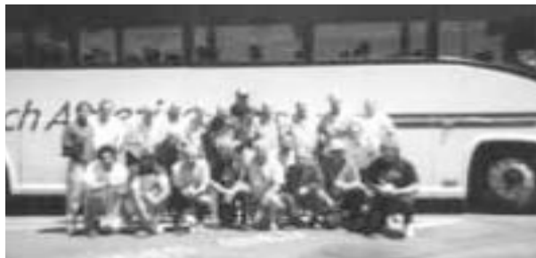
Laughlin stag outing - All smiles having fun.