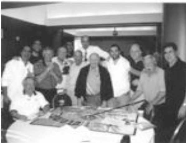
Brothers having fun at Mid Term Convention.