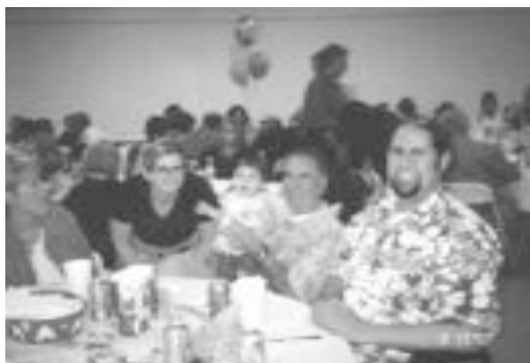
Pat Hill Night