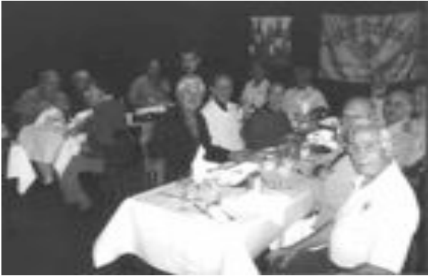
May 2007 Dinner-Meeting at Delaney's Restaurant