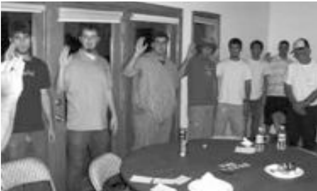
Members of the newly organized Sequoia Juniors being sworn in.