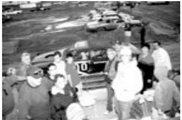
PALM DESERT XXX "DAY AT THE FAIR" Brothers and their Families watching the Destruction Derby Car entered by the Palm Desert Chapter.