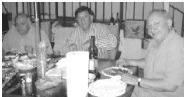
3-15-07 Peninsula Brothers enjoy great Tri-Tip Dinner at our Los Altos Masonic Temple meeting room