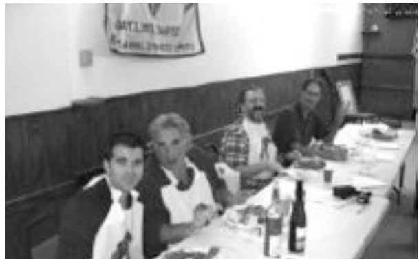
Head Table - Lobster Feed