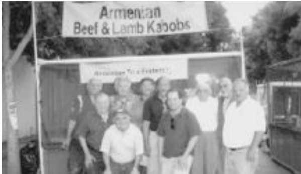
9/8/07 - Peninsula Chapter Annual money-making endeavor at Mt. View Wine & Food Festival.