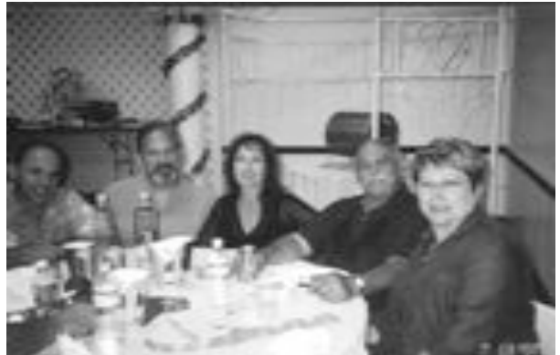
Wild Pig Night

IN MEMORIAM: We are saddened and stunned by the passing of five brothers since the last Trex News: Devastated is how we feel.