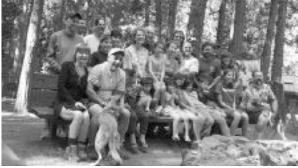
Oakland Families at Camp