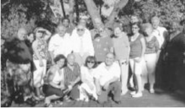
7/22/07 - Peninsula Chapter honors wives and widows.