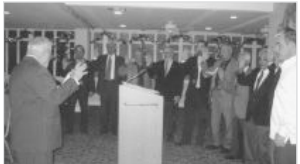
Installing New Officers and Board of Directors.