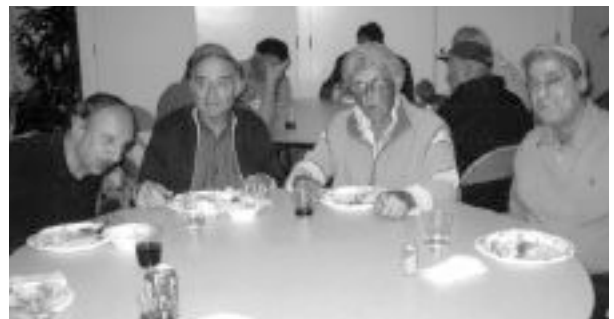
11-15-07 Brothers enjoy Baked Salmon dinner before our meeting