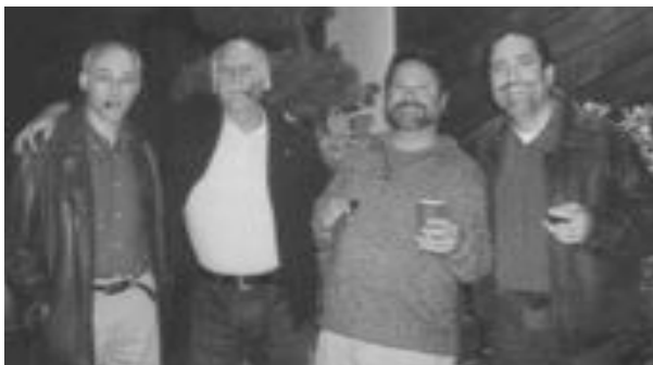
Joint Bay Chapter Lobster Feed Brothers enjoying a good cigar after a full course lobster dinner