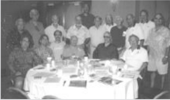
L.A. Trex Convention - Bros. having fun.