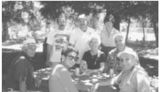
Mt Diablo Family picnic