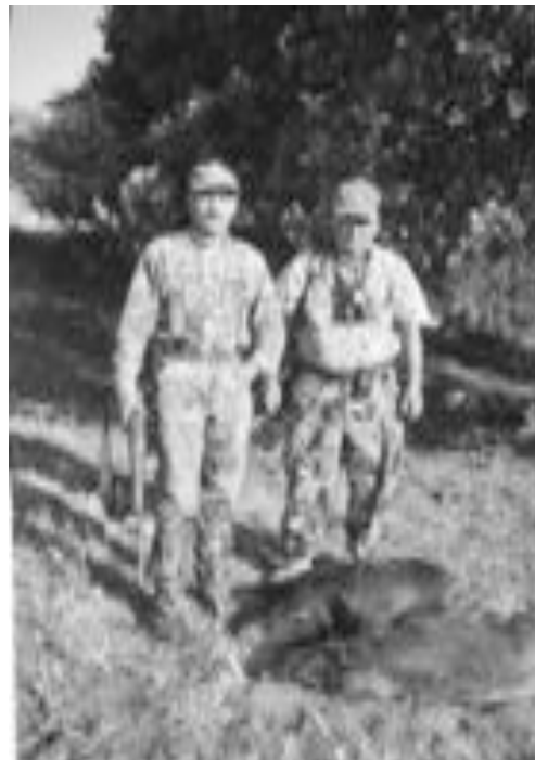
Wild Pig Hunters