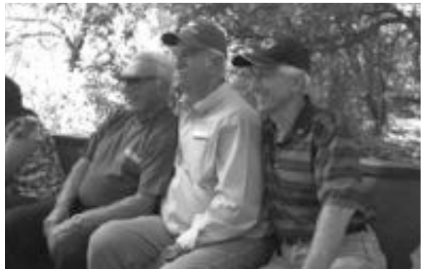
Brothers at Roaring Camp