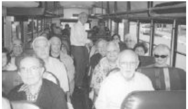
Unsuspecting Brothers and wives on their way to the Mystery Bus Dinner in October.