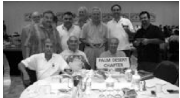
Palm Desert Brothers at the 2007 Triple-X Convention in Los Angeles.