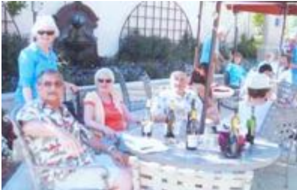
Mt Diablo Brothers and wives enjoying fine wines at Round Hill Country Club Patio Party.