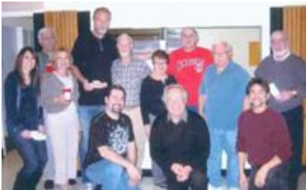
Brothers and wives helping at Fairview Development Party.