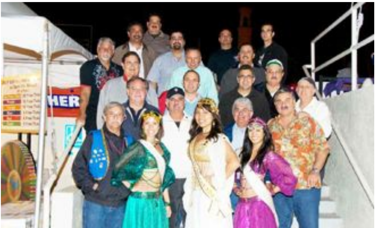
Trex Day at The Fair with Brothers from Palm Desert Chapter and other visiting chapters. The Queen of the Fair and her Court joined in the fun.