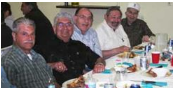
Fresno Chapter Bros. at our Law Enforcement Night at Fresno Club House.