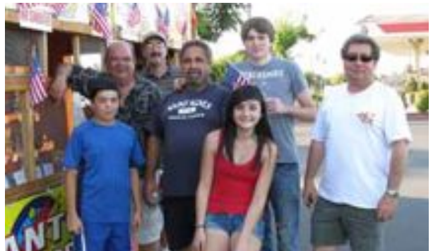
Sequoia Chapter's fireworks stand