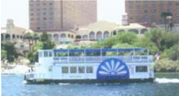
Laughlin Stag Outing. 46 Brothers on this boat.