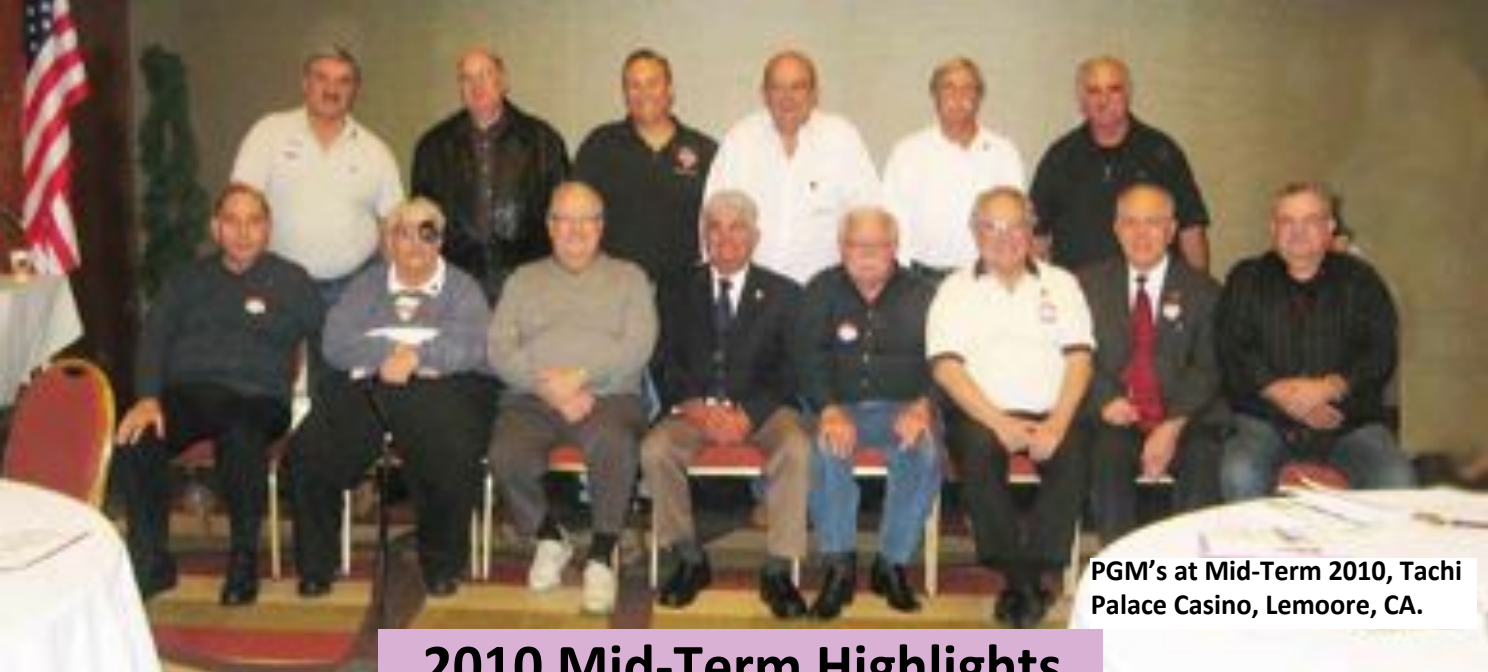
PGM's at Mid-Term 2010, Tachi Palace Casino, Lemoore, CA.