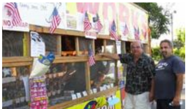
Sequoia Chapter's fireworks stand