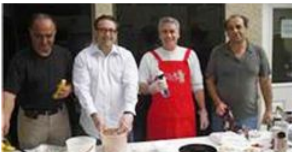
Servers at Ice Cream Party