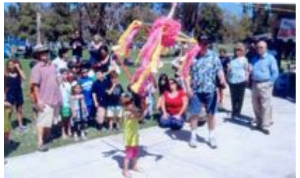
Kids having fun at picnic.