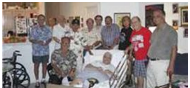
Brothers visit PGM Chuck in Hospital