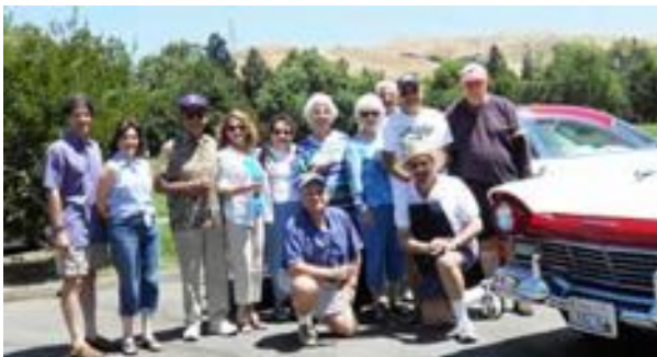
Mt Diablo Family Picnic.