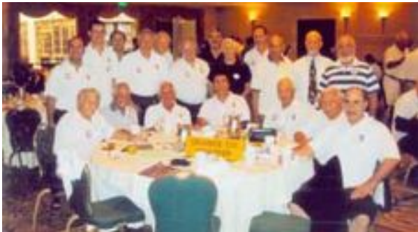
2010 Convention - Brothers Having Fun.