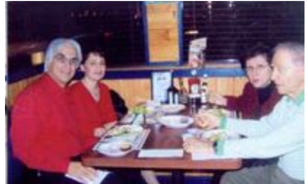
Brothers enjoying Christmas dinner at Yosemite Falls.