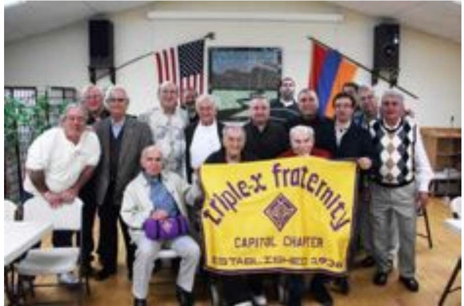
The Happy Clan of Capitol Chapter 2010 joined by Grand Chapter guests.

2010 was another successful year for the Capitol Chapter. We now have the youngest slate of new executive officers with an average age of less than 40! We have great faith that this new team of young officers has the potential to accomplish all of our ambitious expectations. Important items at the top of the list include: increasing the number of our membership; increasing member attendance and participation; adding new activities for the year; meeting or exceeding our charitable donations through increased revenues.