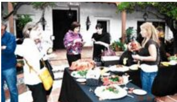
Guests enjoying wine, cheese, hummus spread.