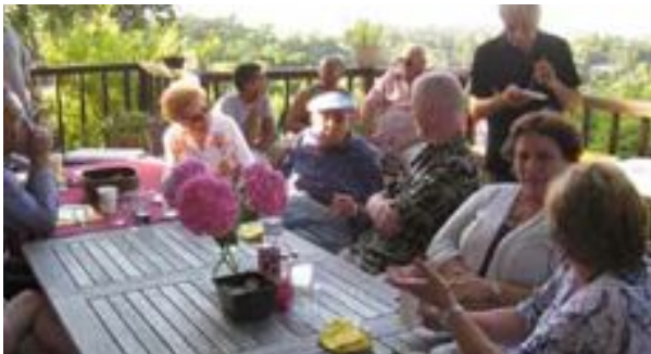
Everyone at the July BBQ had a great time eating and socializing!