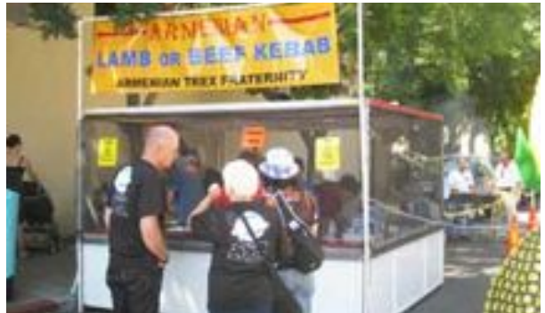
A crowd begins to gather around our food booth at the Mountain View Art & Wine Festival!