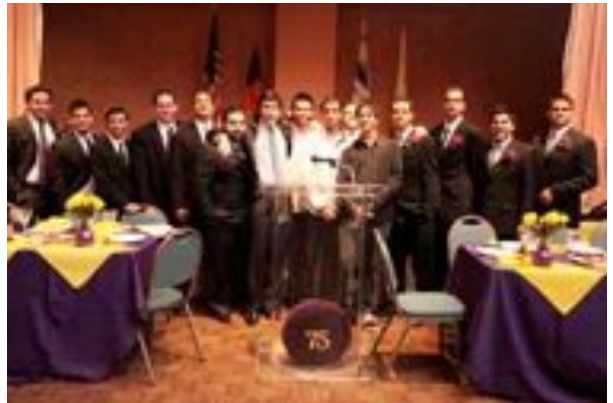
LA Jr. Brothers before the Ceremony