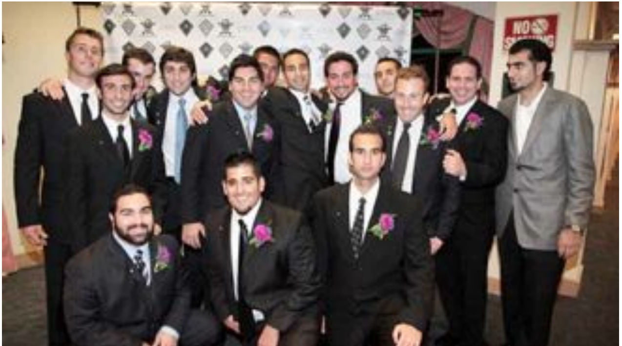
Jr. Brothers after the Anniversary.