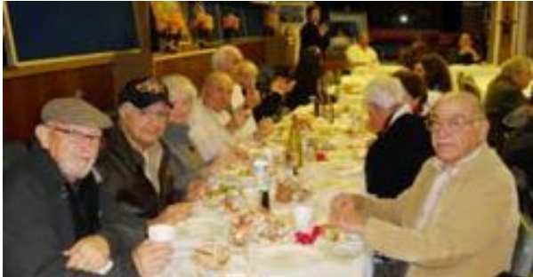
Mt Diablo Crab Feed