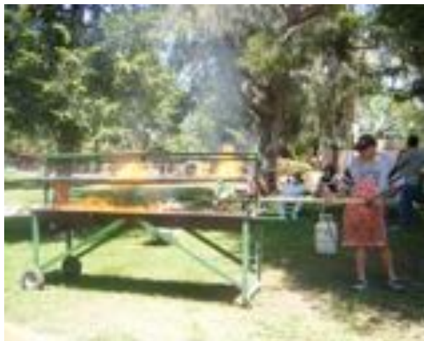
Sequoia Trex Picnic Barbecue