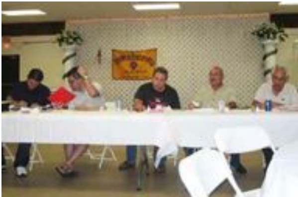
Selma Chapter Officers at a Bus Meeting - Fresno Club House