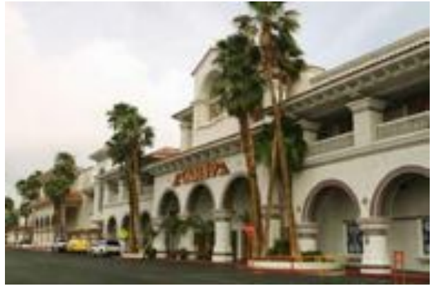
Gold Coast Casino