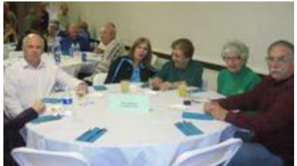
Law Enforcement Night