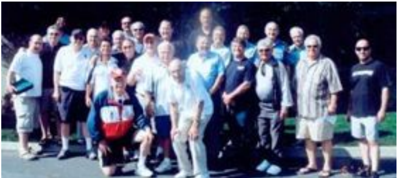
Laughlin Stag Outing