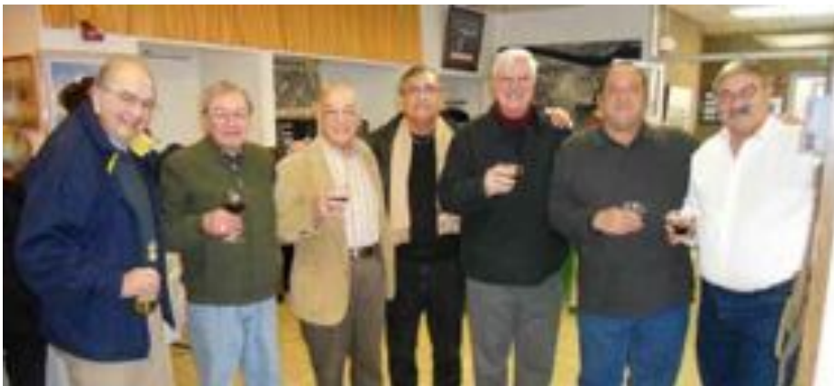
Brothers at Mt Diablo Crab Feed