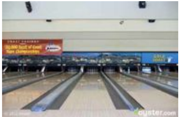
Gold Coast Amenities