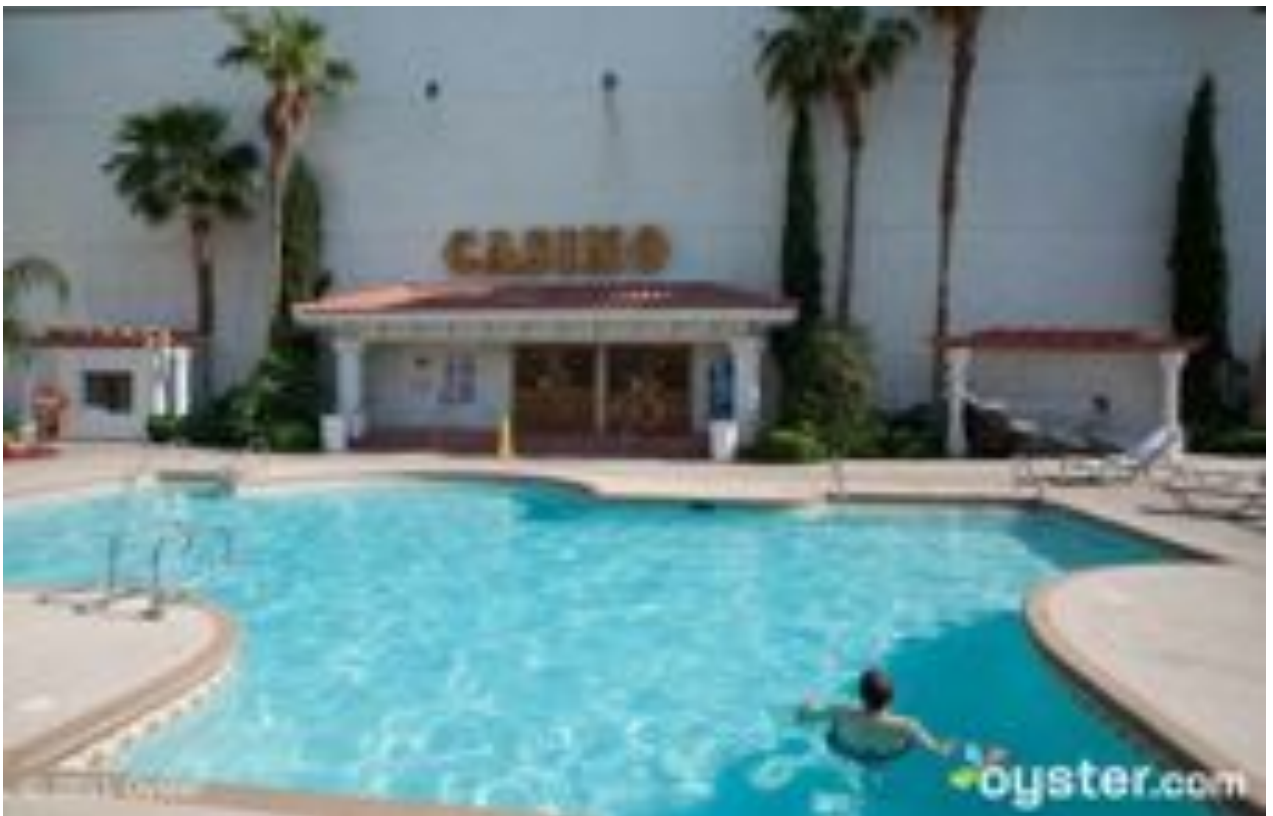
Gold Coast Swimming Pool