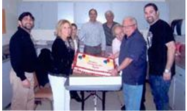
Fairview Developmental Party