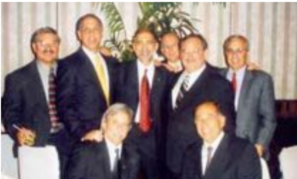
Triple X brothers find time for a picture at a wedding.