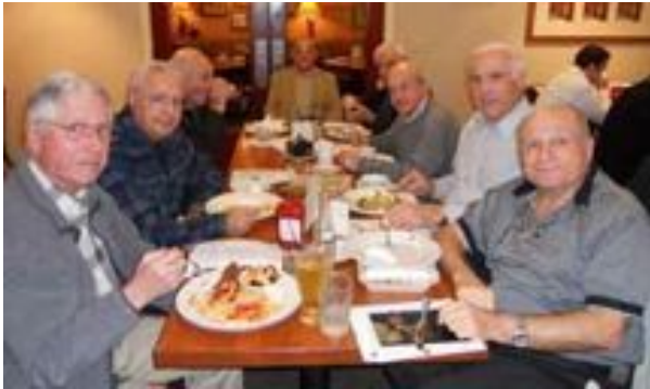
Mt Diablo Brothers enjoying dinner at a Trex Meeting