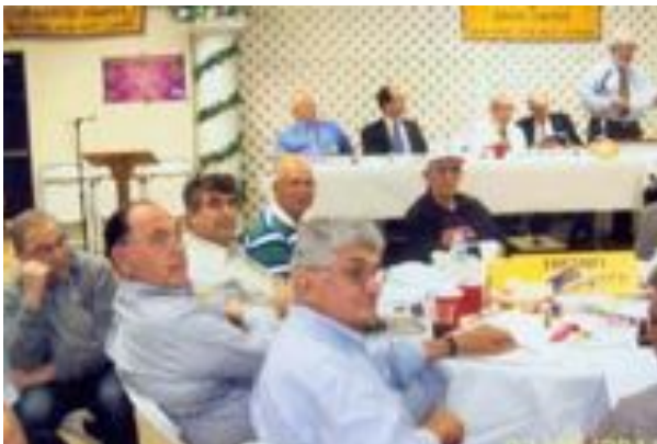
Mid Term in Fresno.