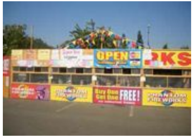
Fourth of July Booth