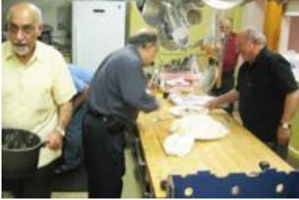
Peninsula members busily preparing yet another delicious dinner for our May monthly meeting.

the mezza and dinner, as well as catching up with our fellow Brothers from all of the other Chapters. Several of the Brothers tried their luck in a nearby Indian casino before the meeting, but alas, their dreams of untold riches went unfulfilled.