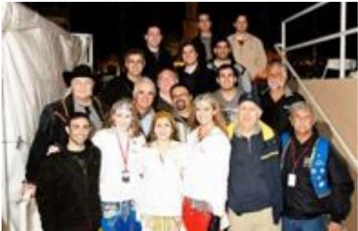
RIVERSIDE COUNTY FAIR & DATE FESTIVAL 2011. Palm Desert Chapter and visiting chapter members with Date Festival Queen's Court