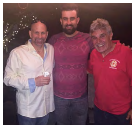
Oakland Bros at Cigar Night