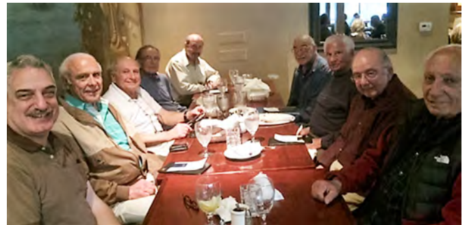
Mt Diablo Trex Dinner Meeting