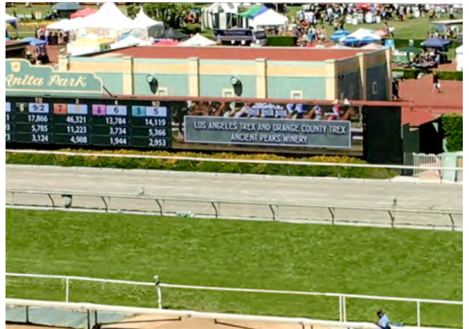
Day at the races Santa Anita Park LA and OC Trex Race.