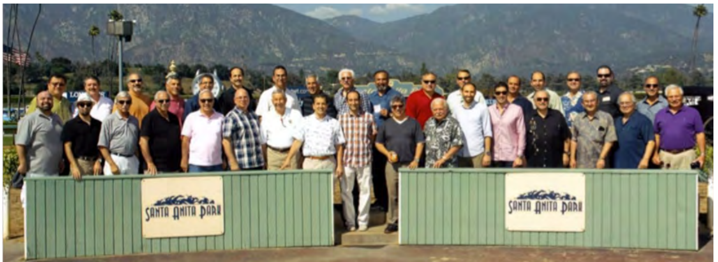
LA, OC and Sequoia Brothers at Santa Anita Day at the Races!