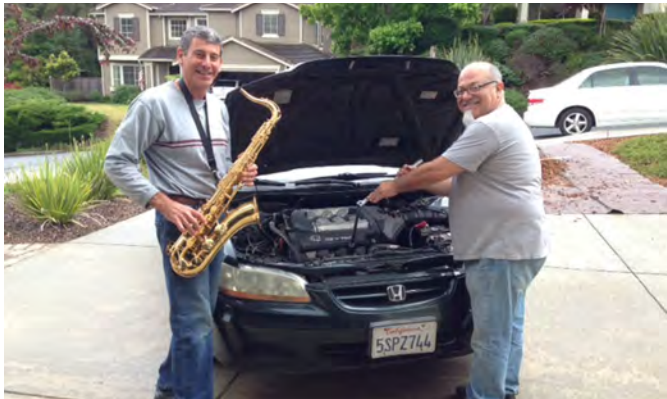
Trex - Brother Helping Brother