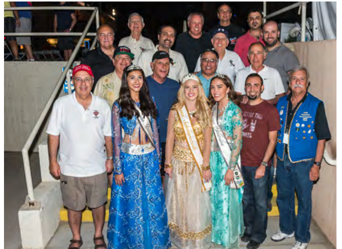
PALM DESERT BROTHERS @ THE DATE FESTIVAL. Palm Desert & LA Brothers with the Date Festival Queen & Princesses