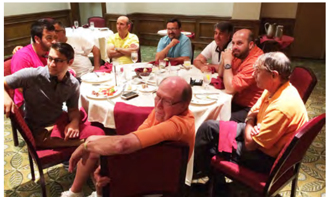
PALM DESERT PROSPECTIVE MEMBER NIGHT 2016. Palm Desert Members with some Prospective Members

In June we held a Prospective New Members night, where several young Armenian men enjoyed the evening with Palm Desert members and showed interest in joining