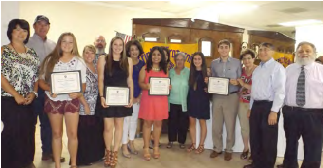
2016 recipients and their families.