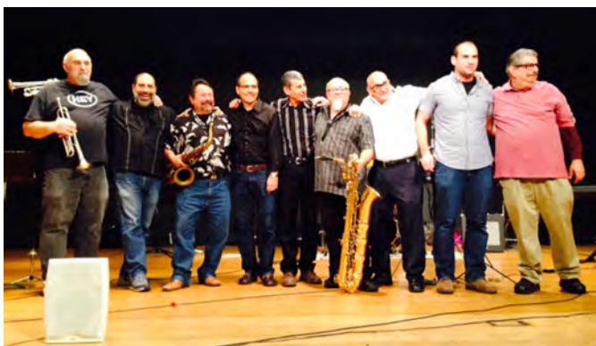
Trex's Brotherly Love