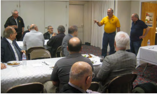
Post-meal pep talk, stand-up comedy, or perhaps even a meeting???