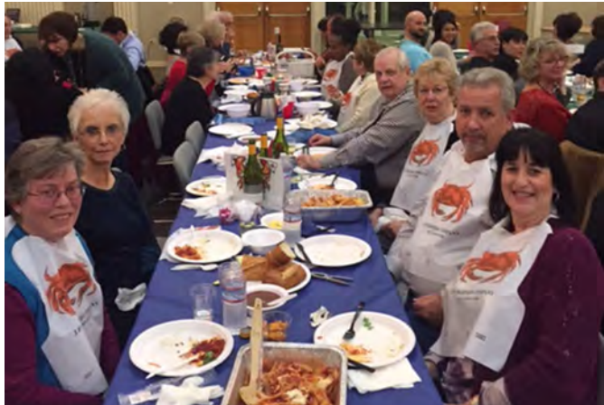
Guests at Crab Feed