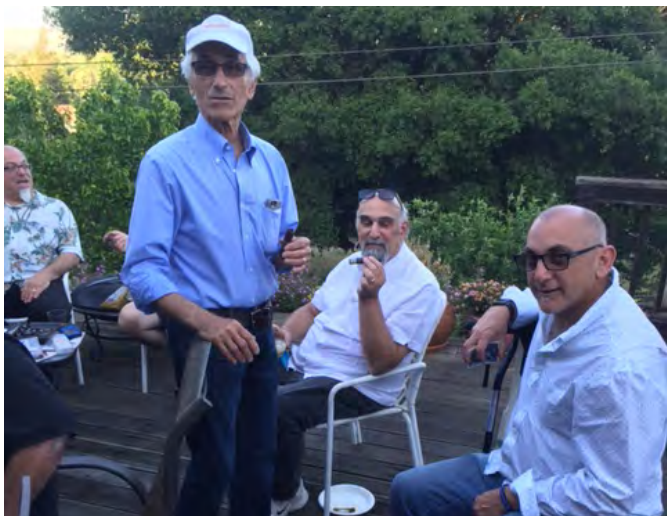
Trex Bros. At Cigar Night