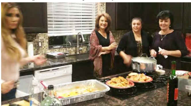
The Extra-Special XMAS Party Ladies that we don't take for "Granite" !