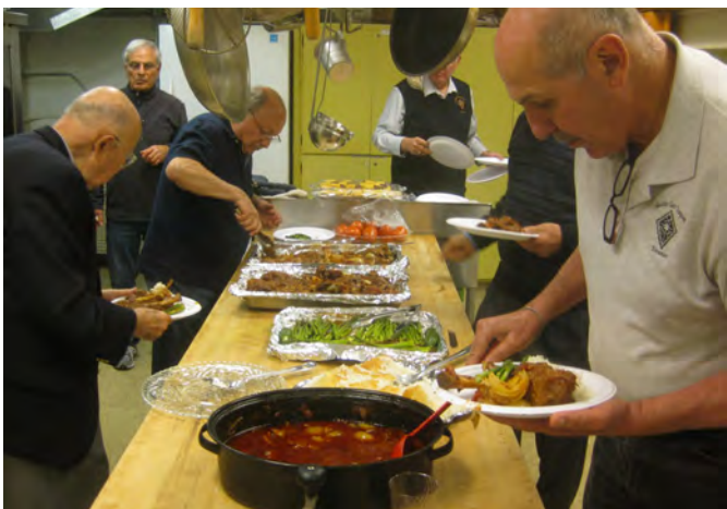
Brothers at the February joint Peninsula/Golden Gate dinner meeting load up their plates with delicious food