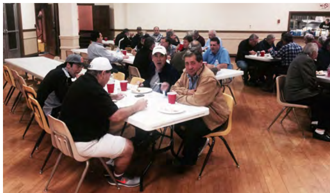
Sequoia Lamb Feed