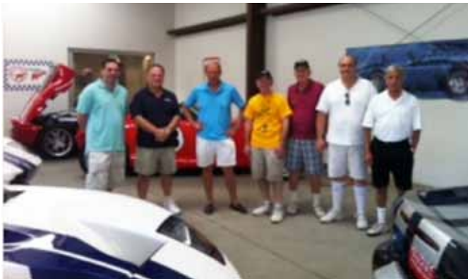
Brothers from far and wide receiving a private tour of Dodge Vipers for Sale in Fresno, California during the 84th Annual Triple X Convention.