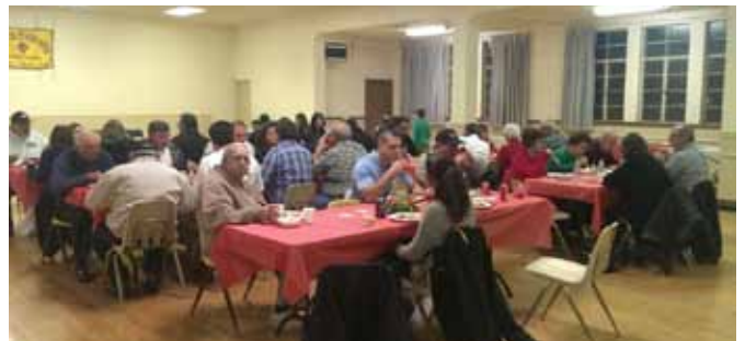
Sequoia Chapter Brothers and family Christmas Party.