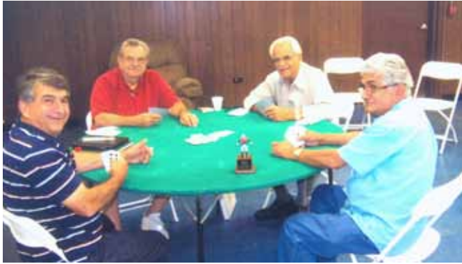
Cards at the Club House.