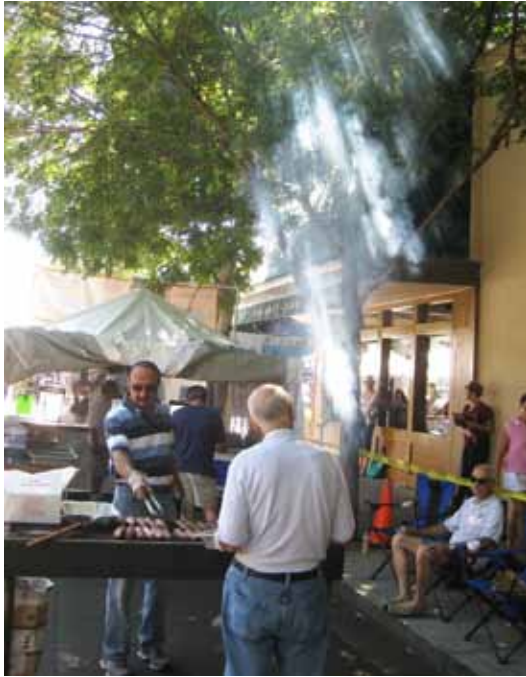
The sun shines down through the trees onto Peninsula Brothers getting the kebabs ready for sale at the Mountain View Art & Wine Festival.