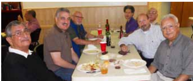
Travis Air Museum tour in July.