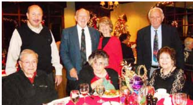
Holiday Party at Round Hill.