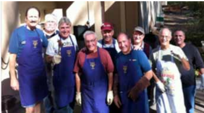
Golden Gate Chapter's brothers at the St. John's bazaar

Once again the Golden Gate Chapter's kebab crews have taken up helping our neighboring Hye churches by manning the BBQs at their picnics and bazaars.