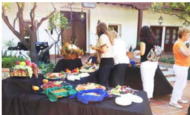
Guests enjoy the delicious food.