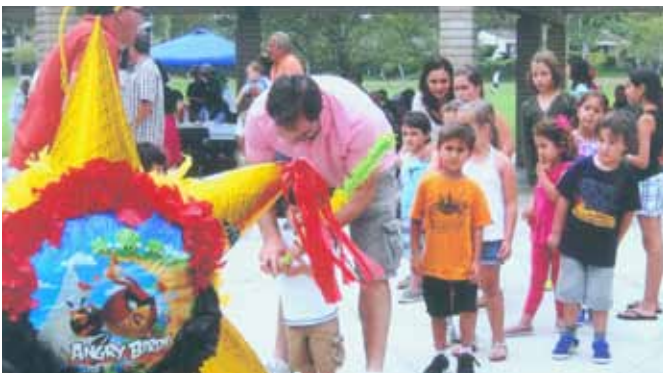
Picnic Pinata with all the kids