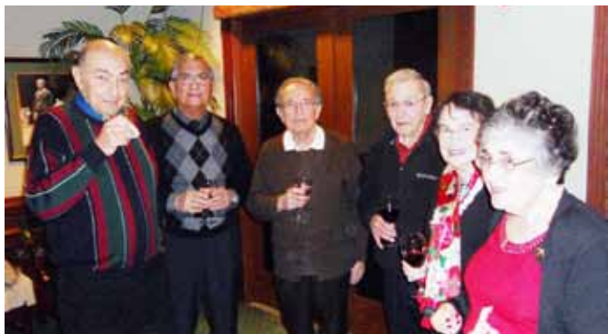
Brother and Wives enjoying wine at Holiday Party.