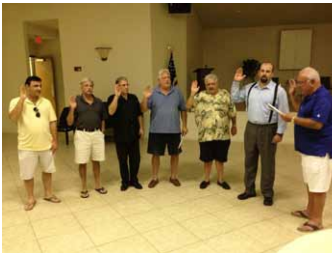
Installation of Officers