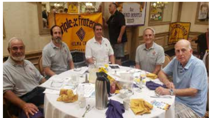
Brothers in attendance at Convention wondering when their order of basterma was going to arrive