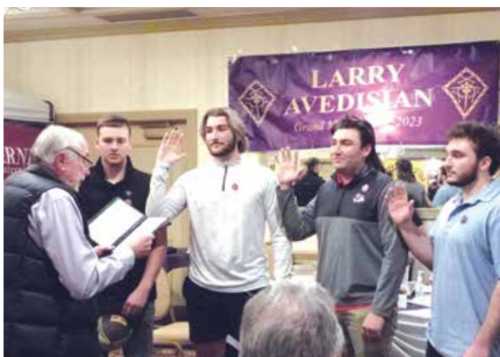
Sequoia Jr. Initiation 2022 Midterm