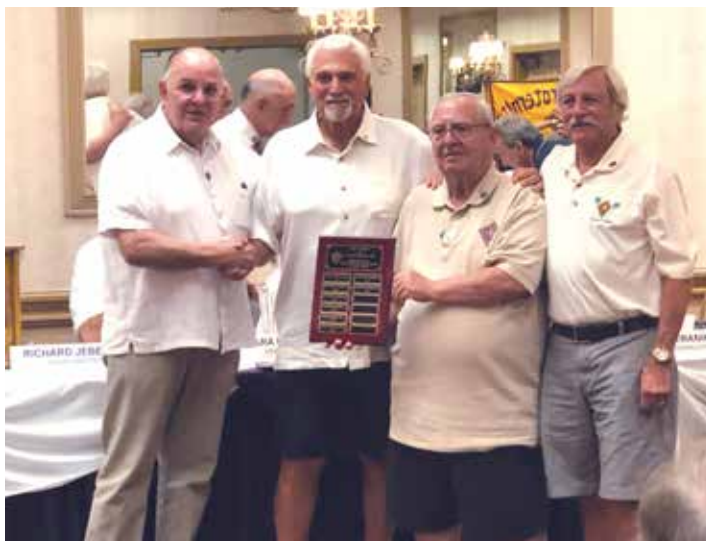
TREX Brother receiving an award