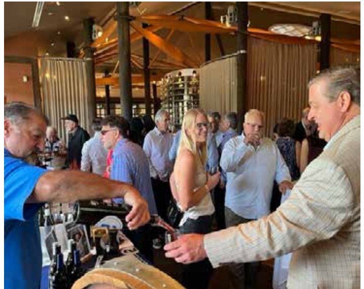
A full house for Wine Tasting