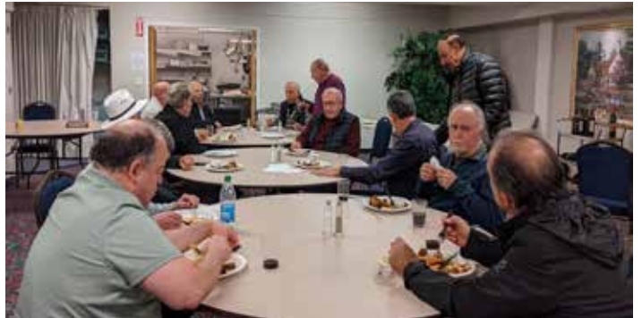
Peninsula Brothers enjoying yet another fantastic dinner prepared by our wonderful chefs!