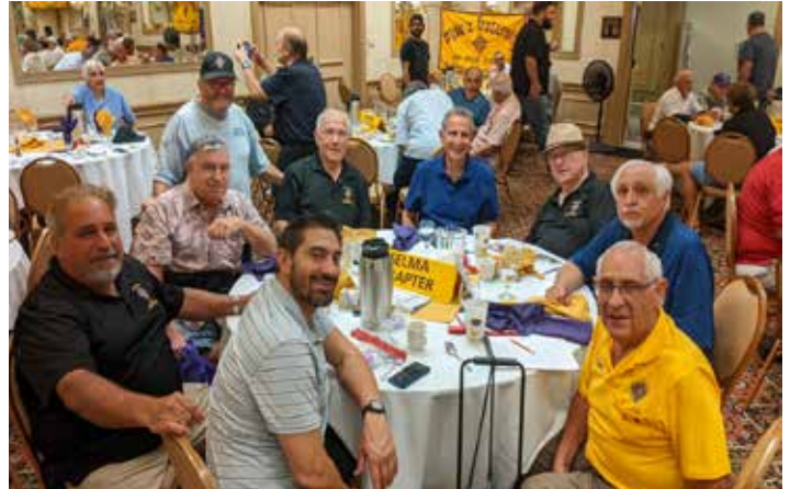
Selma Brothers are ready to rumble at the Annual Convention!