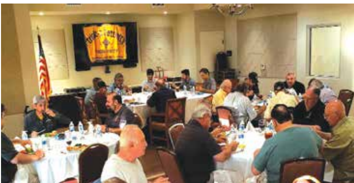
Sept 15, 2022 Tri Chapter Dinner at The Vineyards at the California Armenian Home