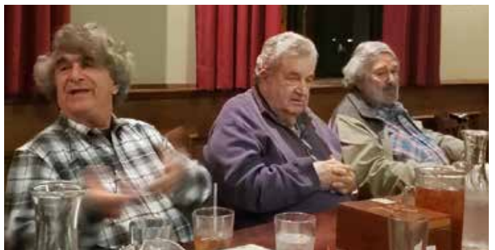
Who..., our barber..., he is on vacation