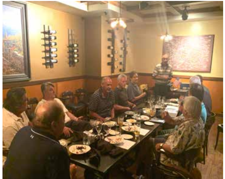
October meeting - Palm Desert Chapter