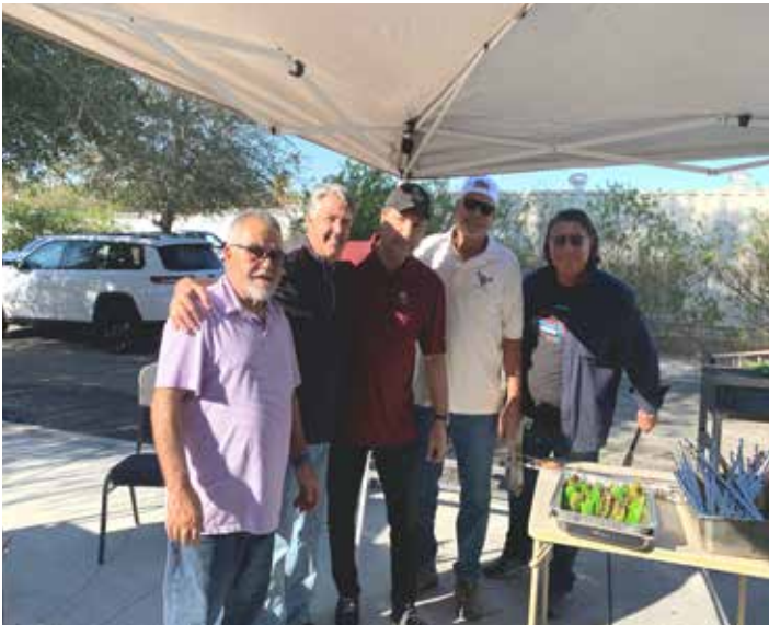
Palm Desert Brothers at the Armenian Festival