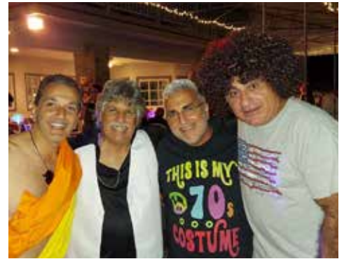
Hare Krishna recruit with John Travolta, Ben Gazzara and Lew Alcindor at the LA TREX 70's party.