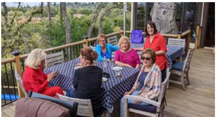
The Picnic at Vic's wouldn't have been the success that it was without the efforts of these amazing women!