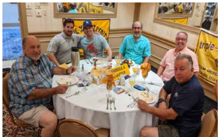
We found some Selma Chapter squatters at the Peninsula Chapter table - finders keepers!