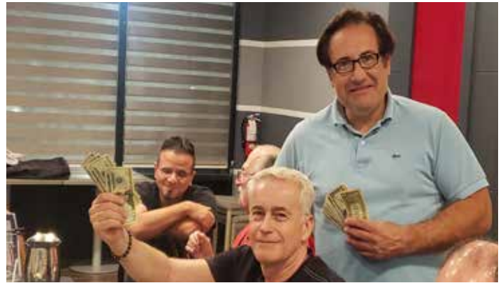
Bros VJ _ Ara celebrate their winnings, hopeful it will be enough to pay their massive fines !