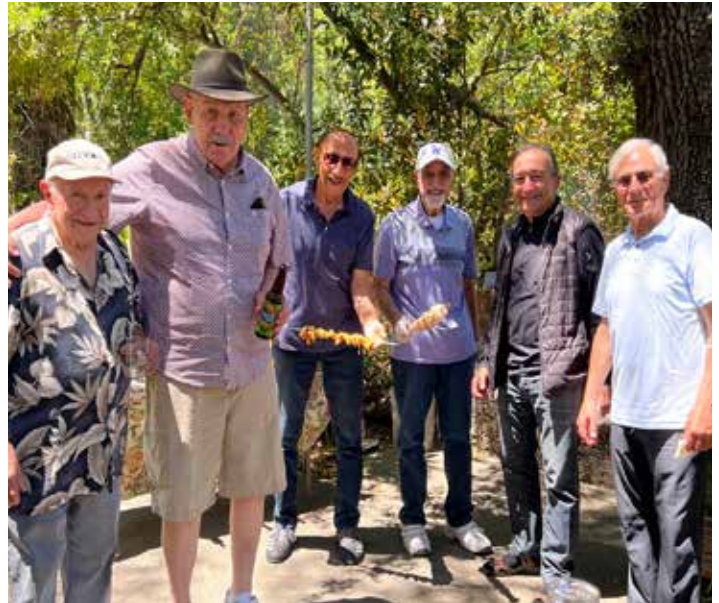
The Trex BBQ crew at the July 12 NorCal Annual Picnic

Peninsula Chapter Assoc. Editor/Corr. Sec./Webmaster Grand Webmaster