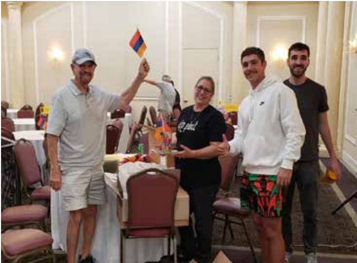
The joys of setting up So Cal Kef Night