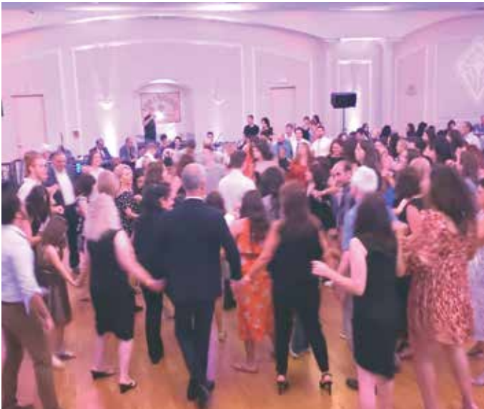
A full dance floor at So Cal Kef Night