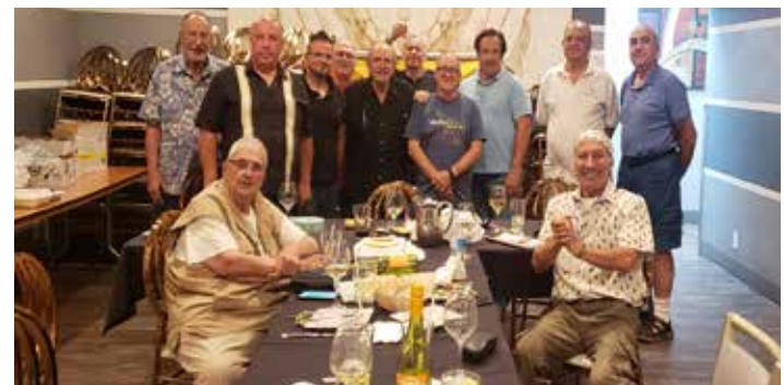
Vegas Brothers gather full force to take over the legendary Shish Kabob House