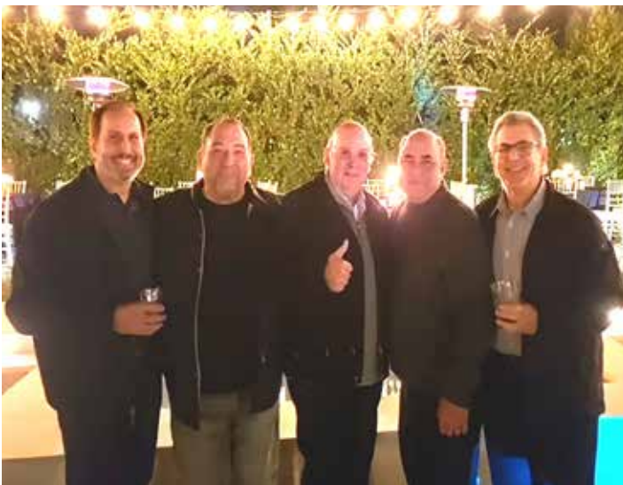
Unknown Brothers enjoying an unknown event