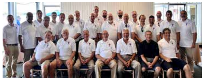
2022 Wine & Cheese Group