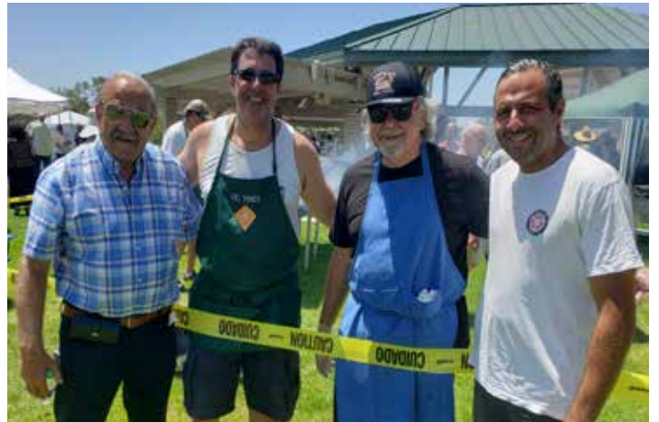
Brothers not respecting the Caution Tape